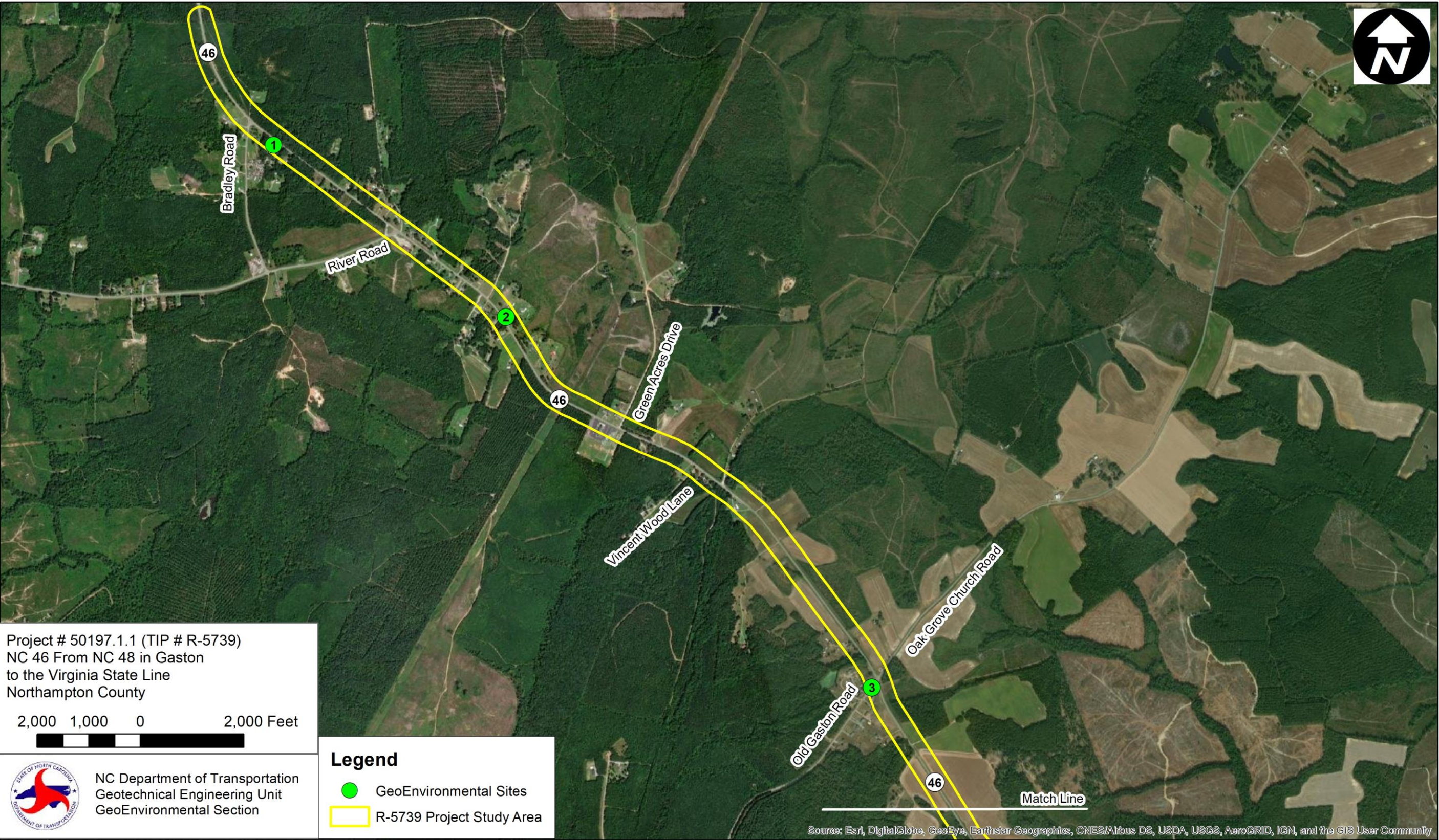
Figure 1 Location of GeoEnvironmental Sites of Concern