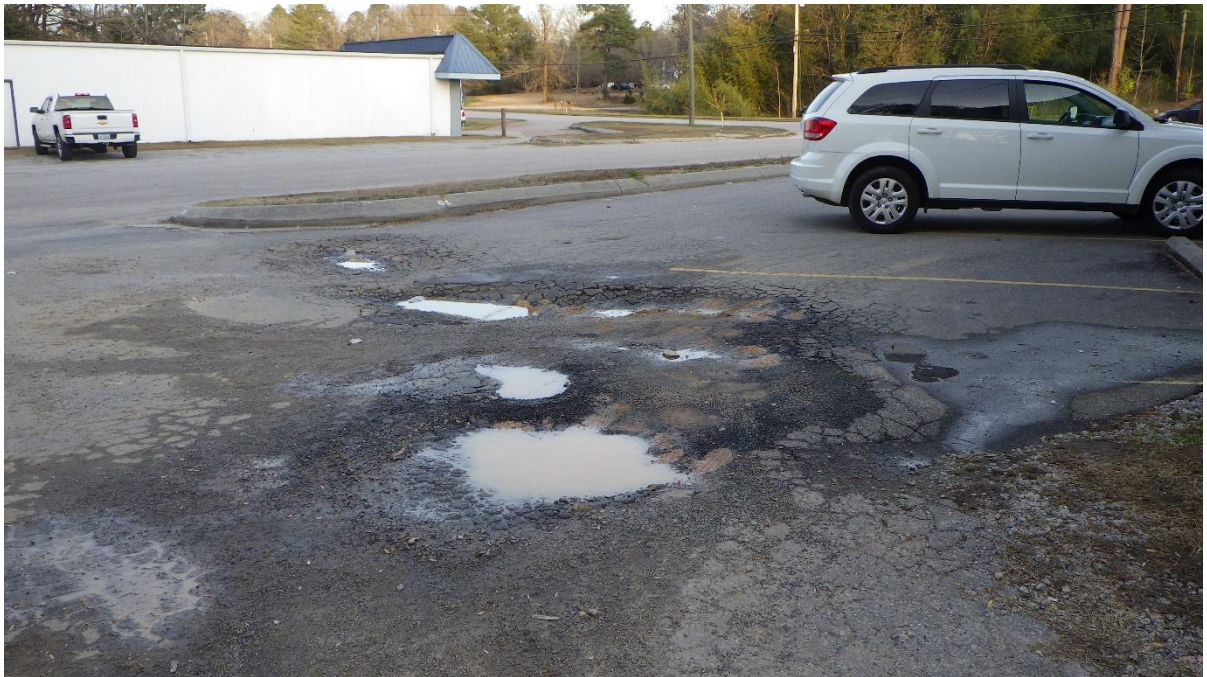
Unknow site disturbance-potential underground objects—possible USTs.