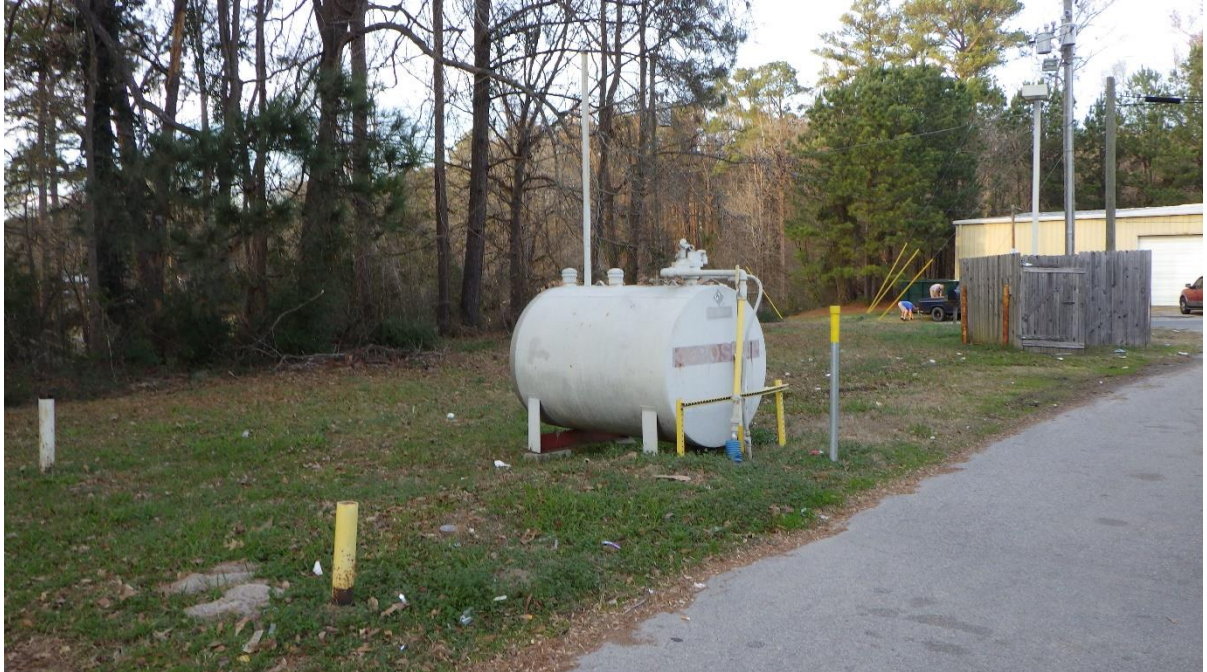
AST at the back