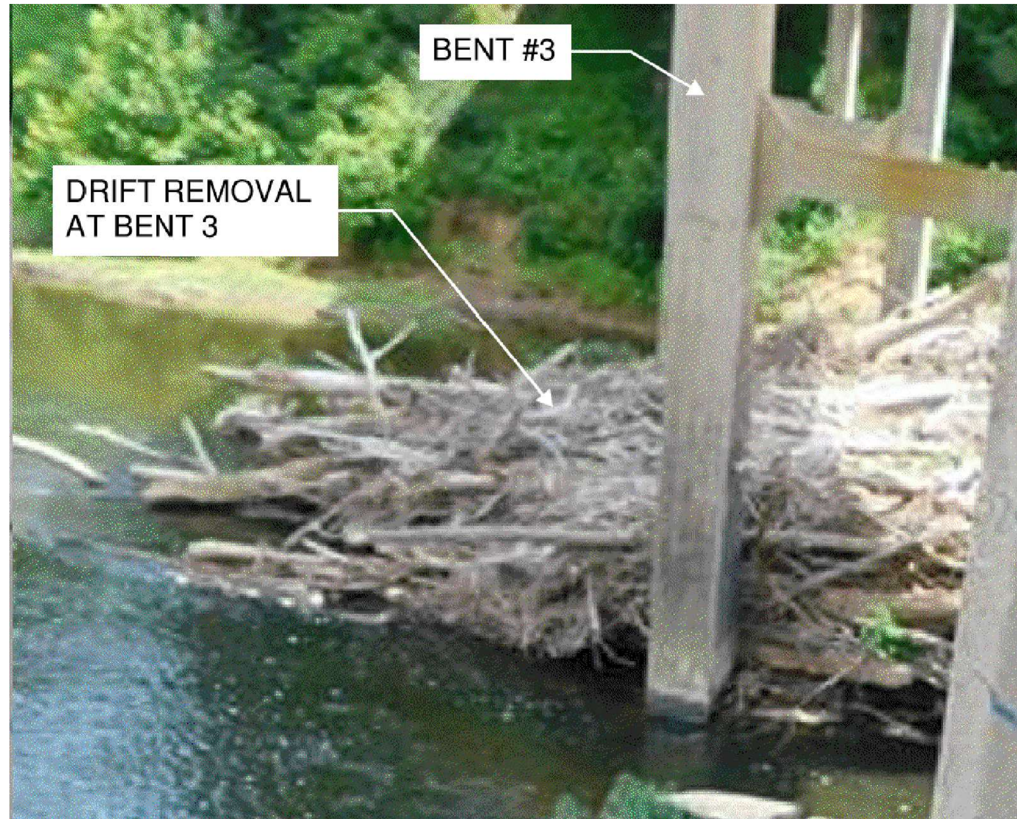
BENT 4 LOOKING SOUTH