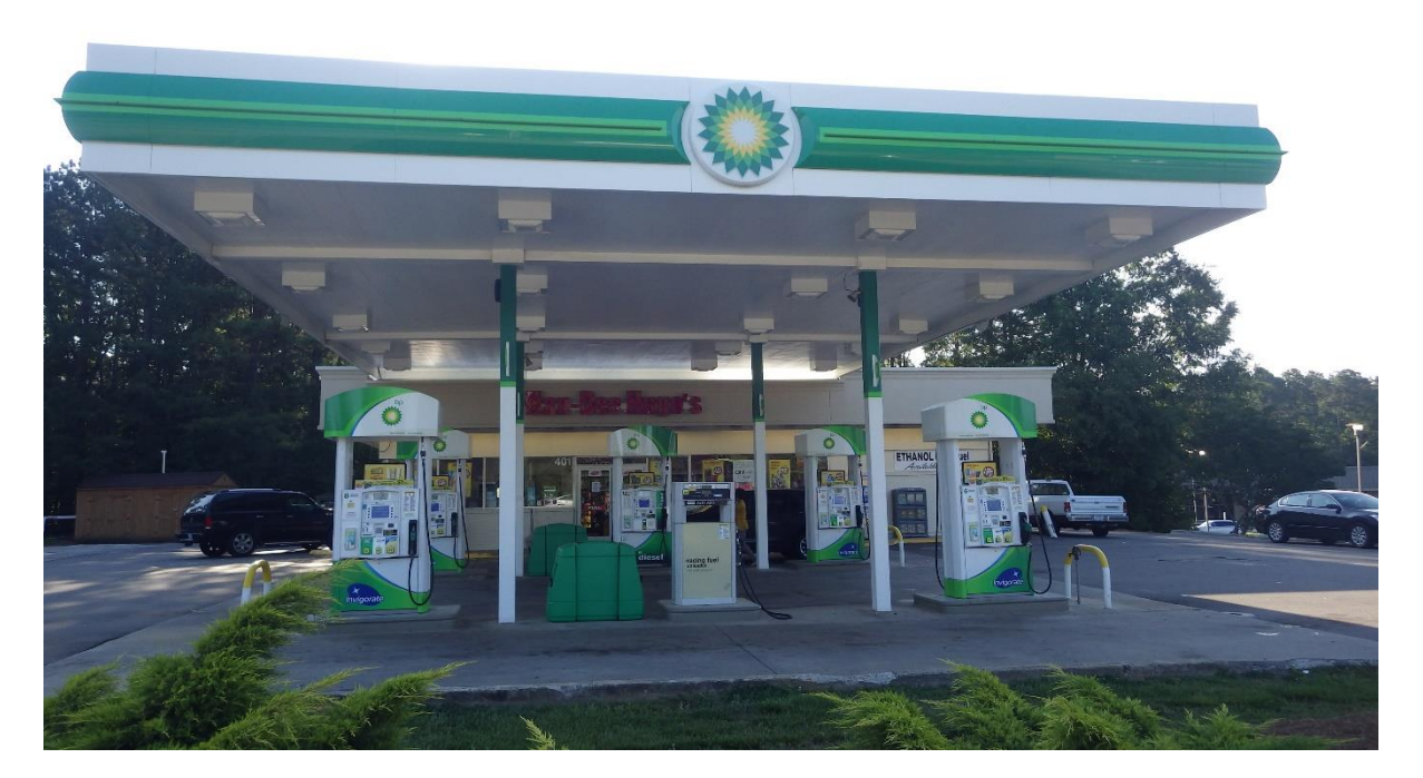
Anticipated Impacts: Low

Sampson Bladen Oil Co Inc. PO Box 469 Clinton, NC 28329