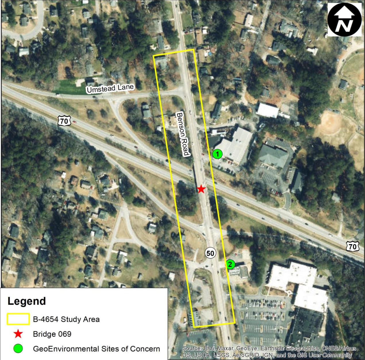
Figure Location of GeoEnvironmental Sites of Concern