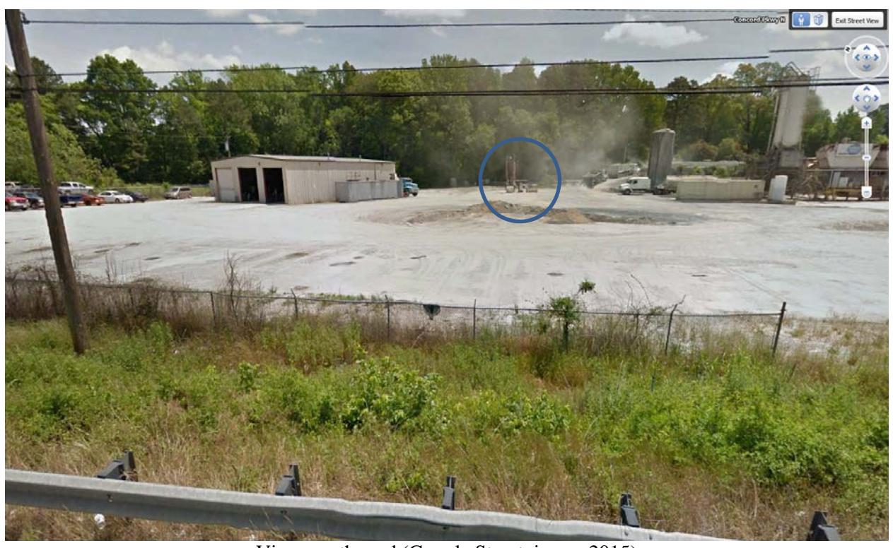
View northward (Google Streetview c. 2015)

Concrete Supply Co. 3823 Raleigh St. Charlotte, NC