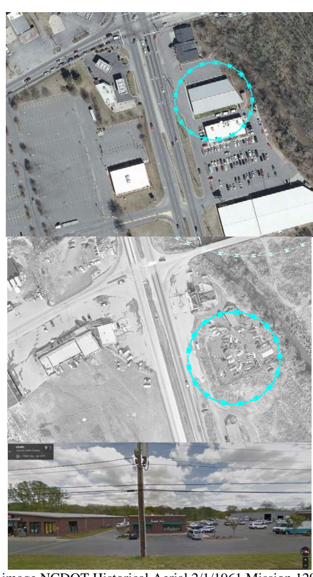
First Image c. 2015; second image NCDOT Historical Aerial 2/1/1961 Mission 129, exposure 13 (top of page is northward); Third Image Google Streetview c. 2016 (view northeastward)

This parcel is located south of the intersection of US 29 & US 601 and Poplar Tent Rd. This single parcel contains Dan'elle Clothing Warehouse, Punchy's Diner, and Punchy Whitaker's Wheel and Tire Pros. This parcel does not appear on the UST Section Registry nor are any NCDEQ incidents associated. There is no evidence of USTs or UST removals. Hydraulic lifts were not observed at the modern Punchy Whitakers Wheel and Tire Pros. In a NCDOT Historical Aerial, several cars and pre-existing buildings were observed that suggest that auto service and/or auto recycling was performed, thus hydraulic lifts or spills from auto recycling may be present. This site is anticipated to present low geoenvironmental impacts to the project.