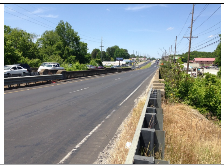
Bridge 57 on US 29 & US 601 over Irish Buffalo Creek. View to the north.