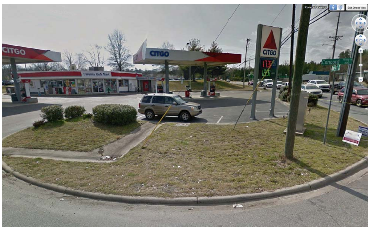
View southeastward (Google Streetview c. 2015)

This active gas station is located on south-southwestern quadrant of the intersection of US 29 & US 601 and Poplar Tent Rd. A groundwater monitoring well was observed near the store building. This site is anticipated to present low geoenvironmental impacts to the project.