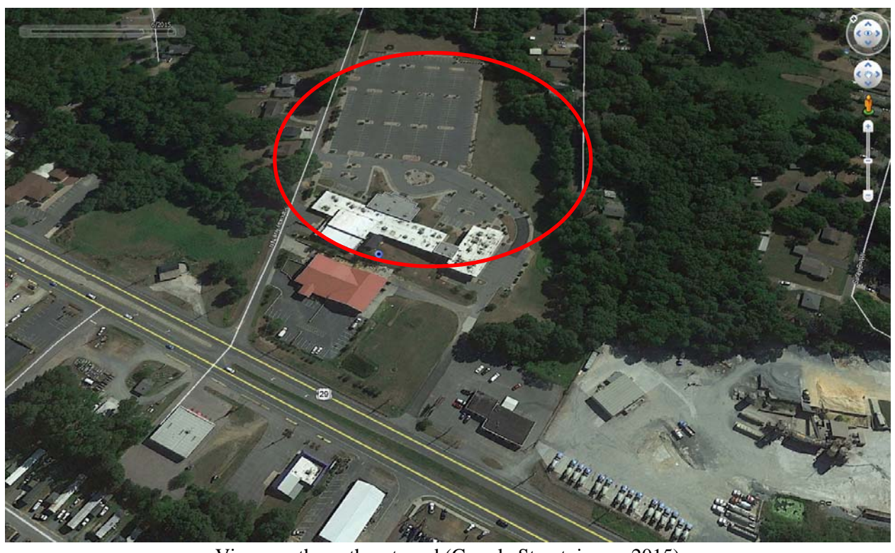
View north-northeastward (Google Streetview c. 2015)

This school maintenance facility is located 1000 feet north of the intersection of US 29 & US 601 and Poplar Tent Rd. behind the site of Webster Radiator and A/C. According to the UST Section Registry a UST registered and an Incident recorded, and a No Further Action status was reportedly granted c. 2001. This site is anticipated to present low geoenvironmental impacts to the project.