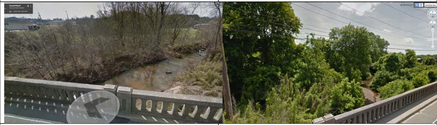
Bridge 57 on US 29 & US 601 view of Irish Buffalo Creek northwestward. (Google Streetview c. 2015)