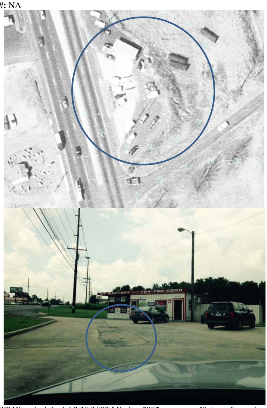
First Image NCDOT Historical Aerial 3/10/1993 Mission 3092, exposure 60 (top of page is northward); Second Image view northward

This car battery sales facility and apparent former gas station is located 1000 feet north of the intersection of US 29 & US 601 and Poplar Tent Rd. A NCDOT Historical Aerial suggests it was a gas station (first image, blue circle), and an apparent former pump island is evident in the concrete (second image, blue circle). This site is anticipated to present low geoenvironmental impacts to the project.