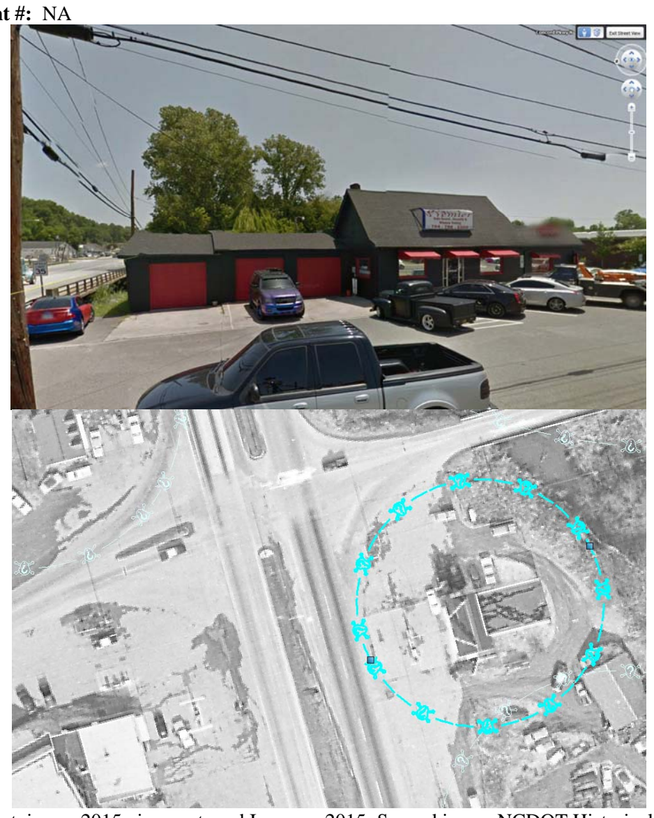
First Image Streetview c. 2015 view eastward Image c. 2015; Second image NCDOT Historical Aerial 2/1/1961 Mission 129, exposure 13 (top of page is northward)

This apparent former gas station is located on southeastern quadrant of the intersection of US 29 & US 601 and Poplar Tent Rd. The architectural style, age, location and NCDOT Historical Aerial suggest that it operated as a gas station c. 1961. This site is anticipated to present low geoenvironmental impacts to the project.