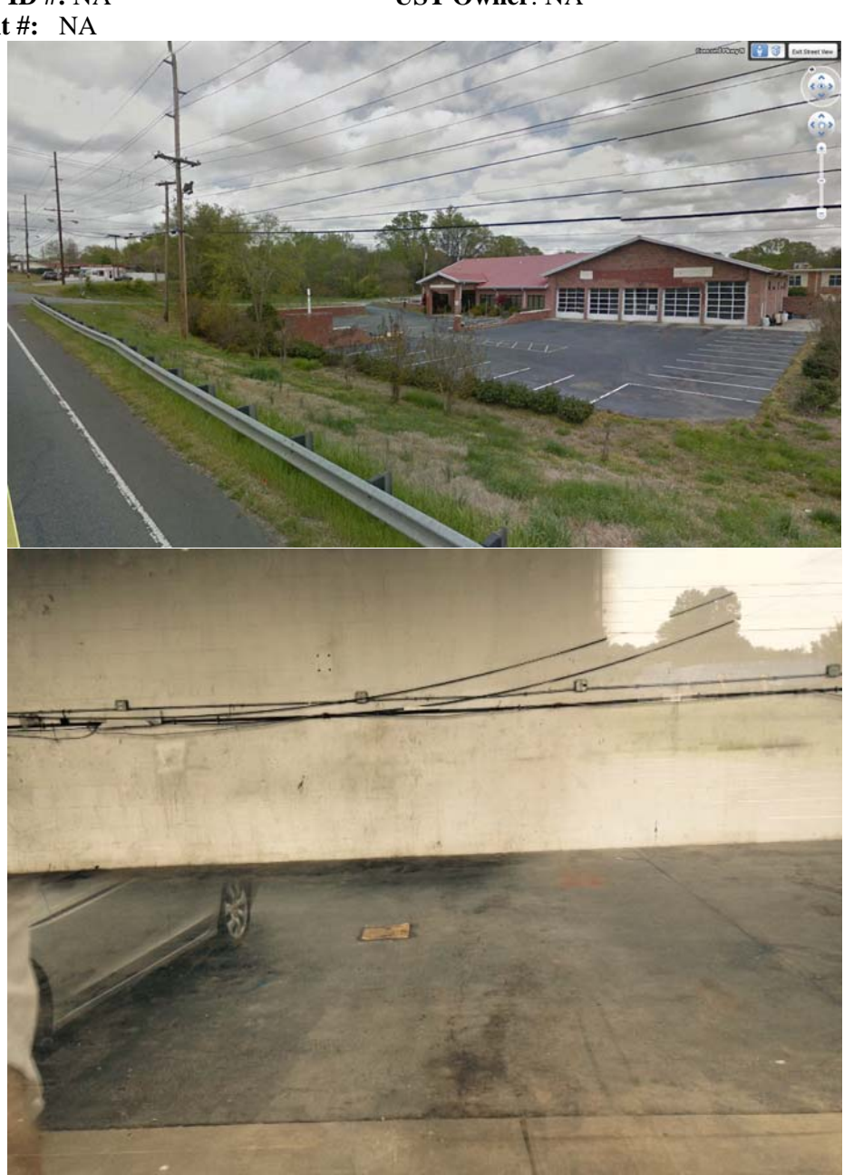
View north-northeastward (Google Streetview c. 2015)

Greenwich Investors XLV Reo LLC c/o Wmd Asset Management LLC 6279 Dupont Station Ct. E Jacksonville, FL UST Owner: NA