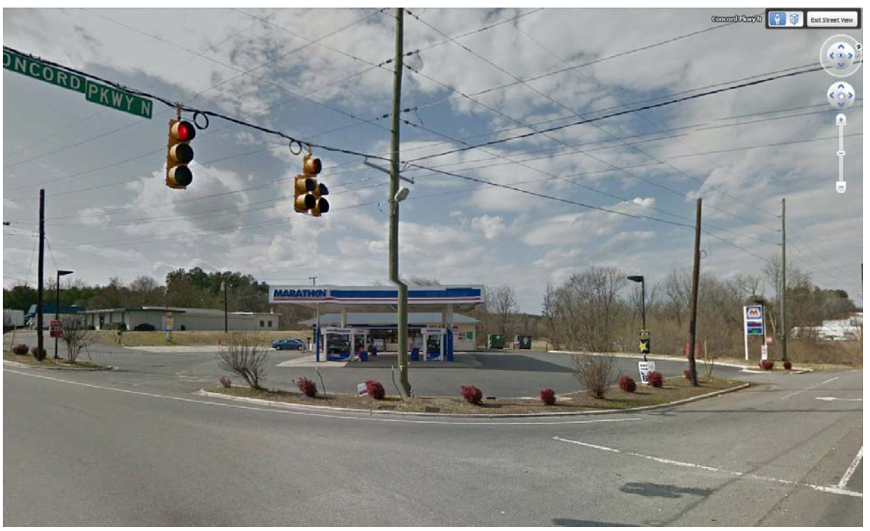
View northwestward (Google Streetview c. 2015)

This active gas station is located on the western quadrant of the intersection of US 29 & US 601 and Poplar Tent Rd. An Incident was assigned by NCDEQ. This site is anticipated to present low geoenvironmental impacts to the project.