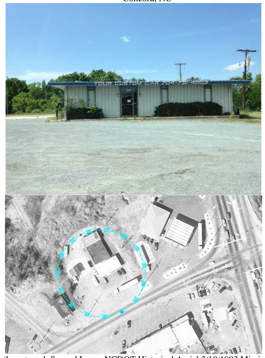
First image view northwestward; Second Image NCDOT Historical Aerial 3/10/1993 Mission 3092, exposure 60 (top of page is northward);

Grady Carpenter 2242 Poplar Tent Rd. Concord, NC