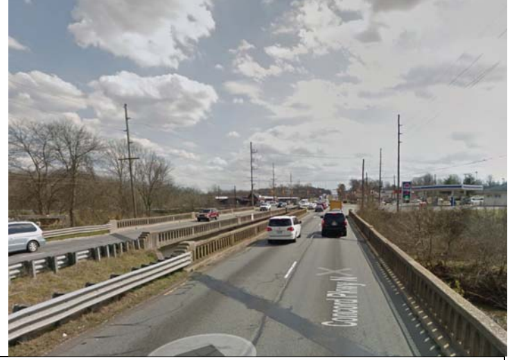
Bridges 57 (left) & 59 (right) on US 29 & US 601 over Irish Buffalo Creek. View to the south.