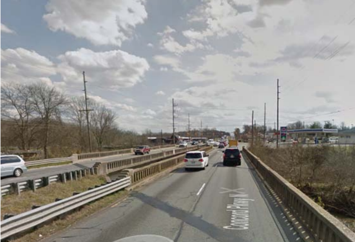
Bridges 57 (left) & 59 (right) on US 29 & US 601 over Irish Buffalo Creek. View to the south. (Google Streetview c. 2015)