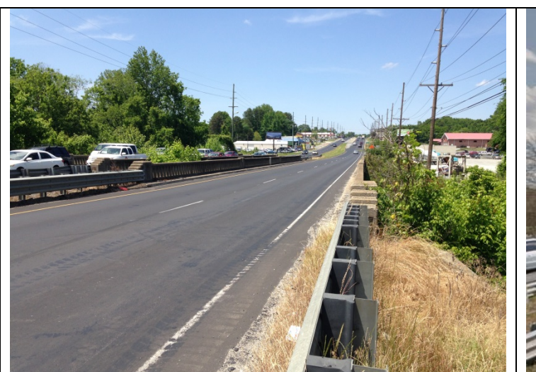
Bridge 57 on US 29 & US 601 over Irish Buffalo Creek. View to the north.