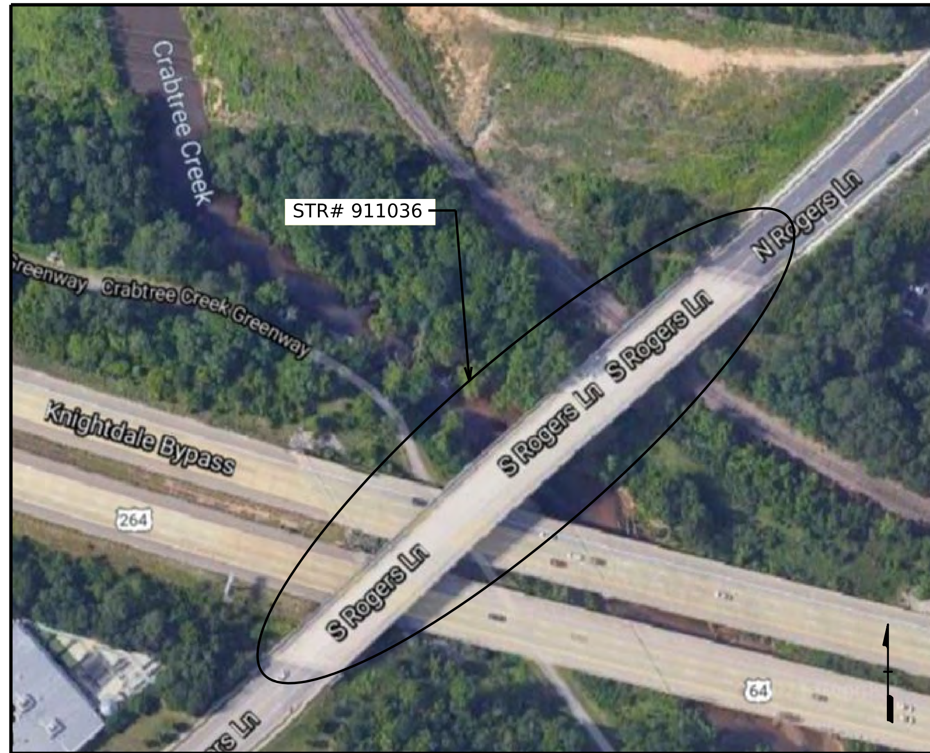
BRIDGE 911039 LOCATION SKETCH