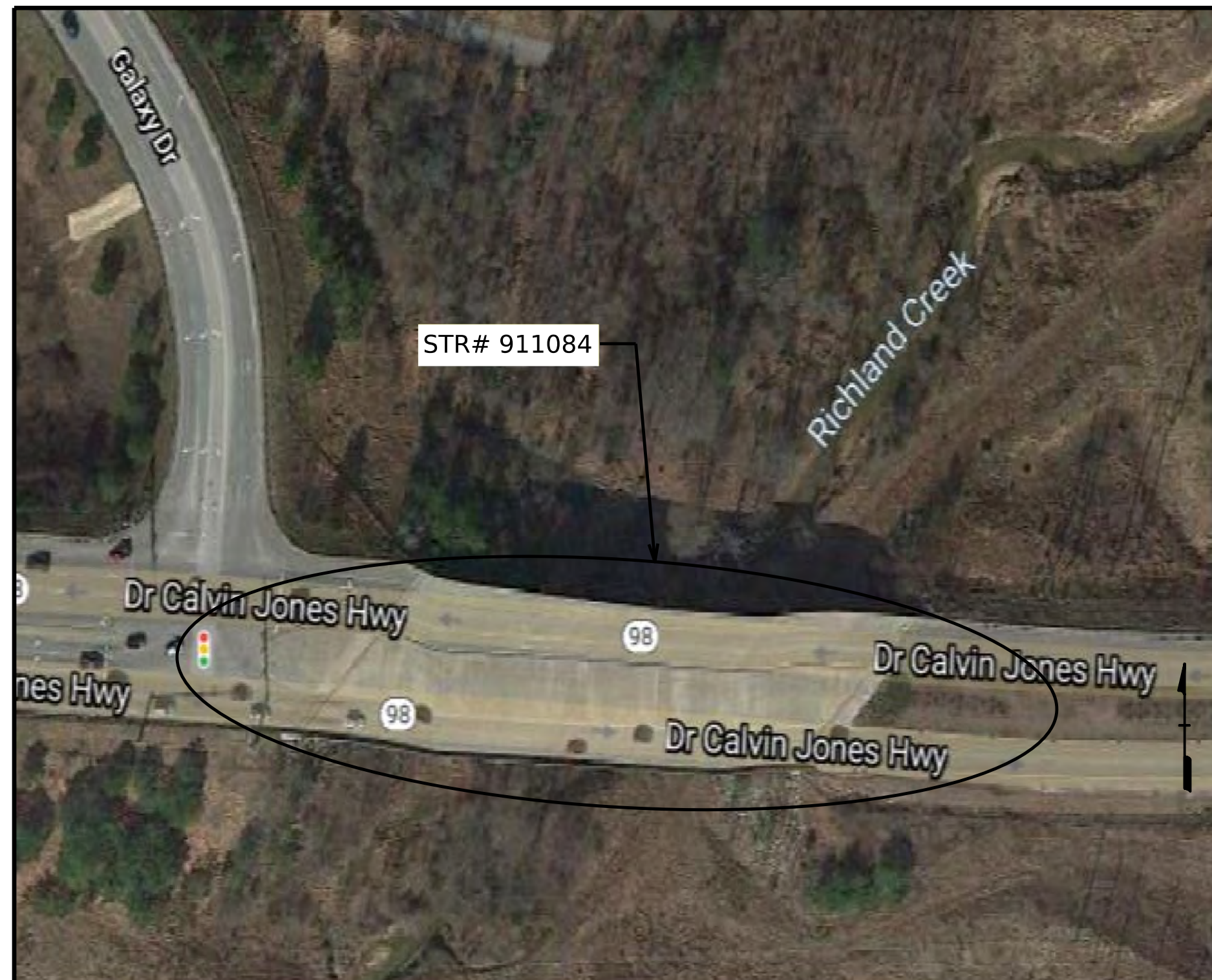
BRIDGE 911084 LOCATION SKETCH