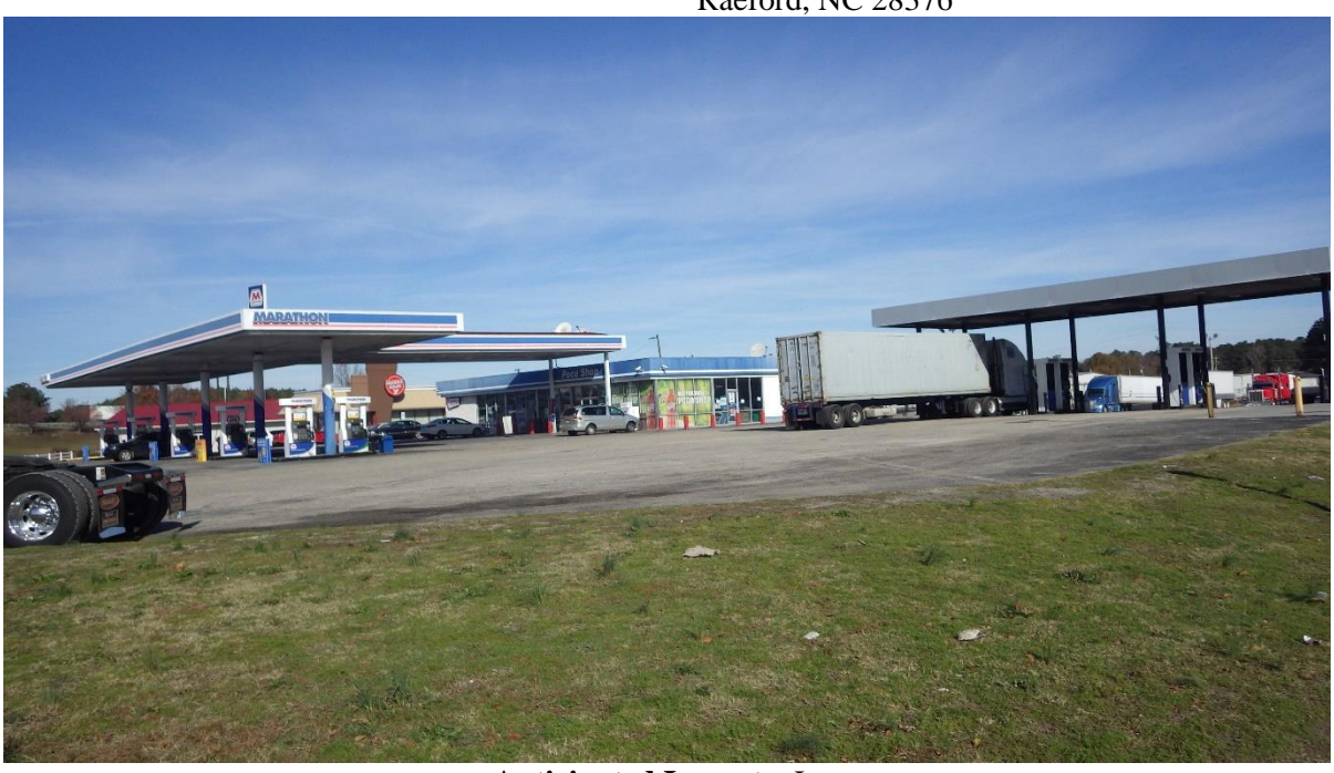
Anticipated Impacts: Low

RSAP of Raeford LLC 7590 Philip Church Rd Raeford, NC 28376