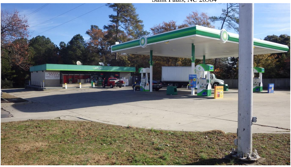
Anticipated Impacts: Low

Alhobishi Convenience Stores & Rentals Inc. 19369 Hwy 301 N Saint Pauls, NC 28384