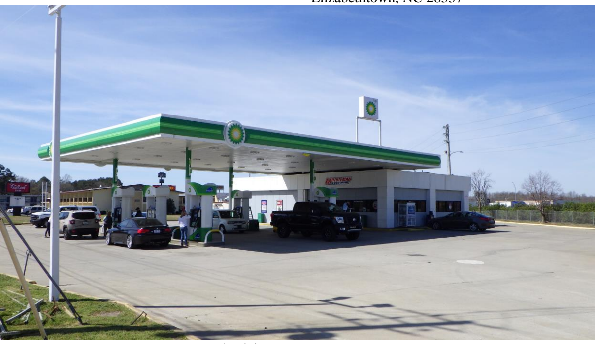
Anticipated Impacts: Low

This site is currently an active convenience store /gas station. It is located on the southwest quadrant of N. Roberts Ave (NC 211) and N. Rowland Rd at the I 95 northbound exit ramp. According to the UST section registry there are four (4) USTs currently in use. Four USTs were removed in 1995 under the previous facility (Exxon 43708). There are two (2) incidents associated with this facility. Incident # 13344 was closed out in 1998. Incident # 42045 is still active. One monitoring and recovery vault were observed during the site investigation.