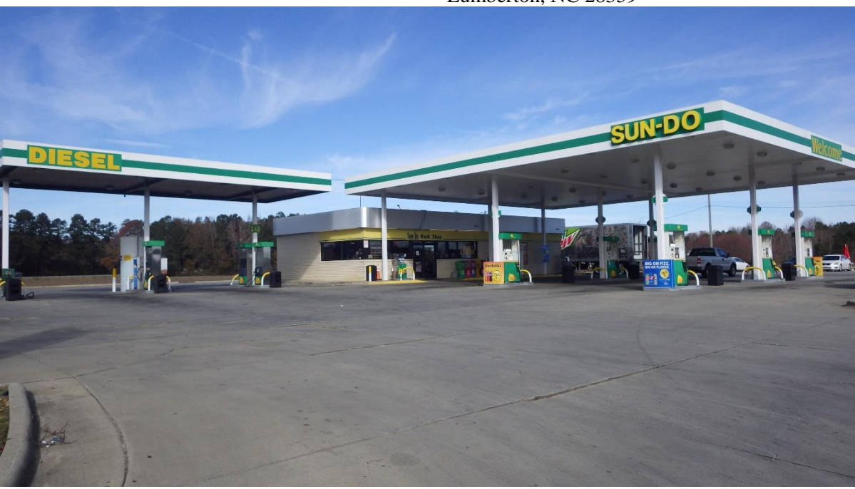
Anticipated Impacts: Low

This site is an active convenience store/gas station. It is located on the northwest side of US 301 at the I 95 North ramp. According to the UST section registry there six (6) UST currently in use. There are no known incidents associated with it.