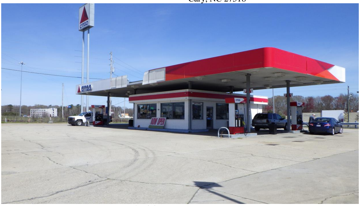
Anticipated Impacts: Low

Champions Properties, Inc 805 Cricketfield Ln Cary, NC 27518