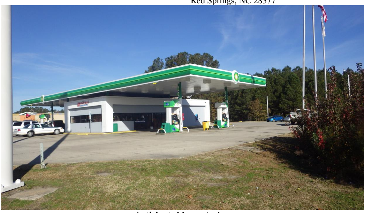
Anticipated Impacts: Low

Red Springs Fuel Oil Co Inc. PO Box 827/West Fourth Ave Red Springs, NC 28377