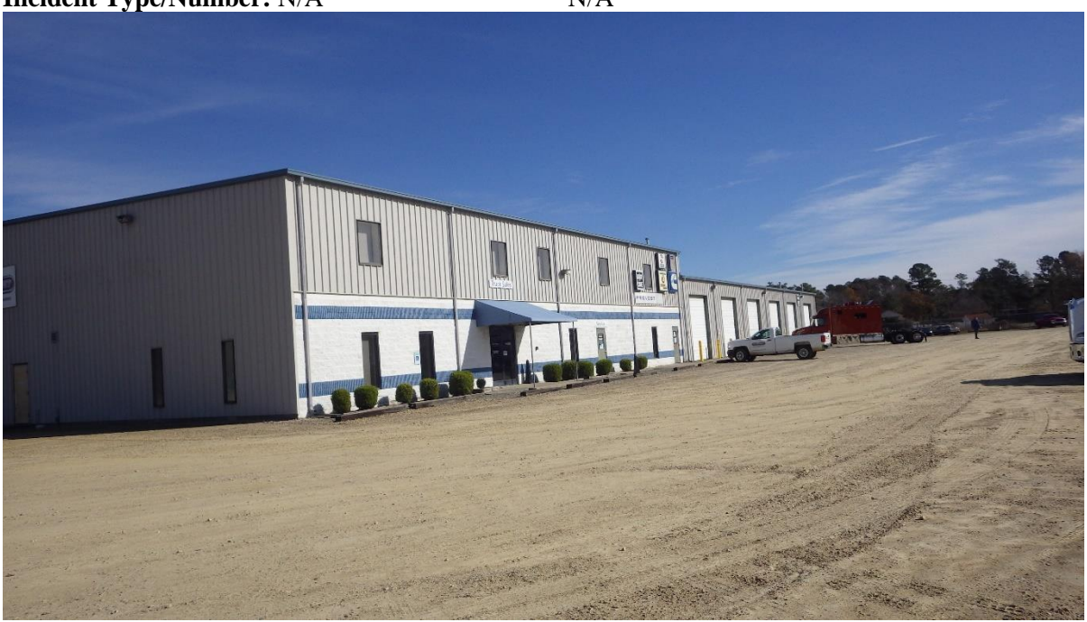
Anticipated Impacts: Low

This site currently operates as a truck sales and service shop. It is located at the dead end of N. Sanford St approximately 600 feet north of W. Broad St. The address is not listed in the UST section registry and there are no known incidents associated with it. There is one (1) used oil AST located on the southeast corner of the building.