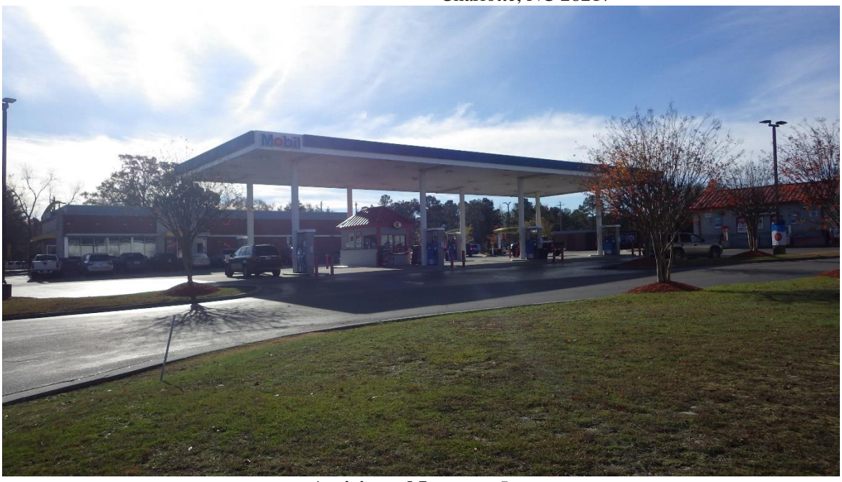
Anticipated Impacts: Low

Circle K Stores Inc. 2550 W. Tyvola Rd STE 200 Charlotte, NC 28217