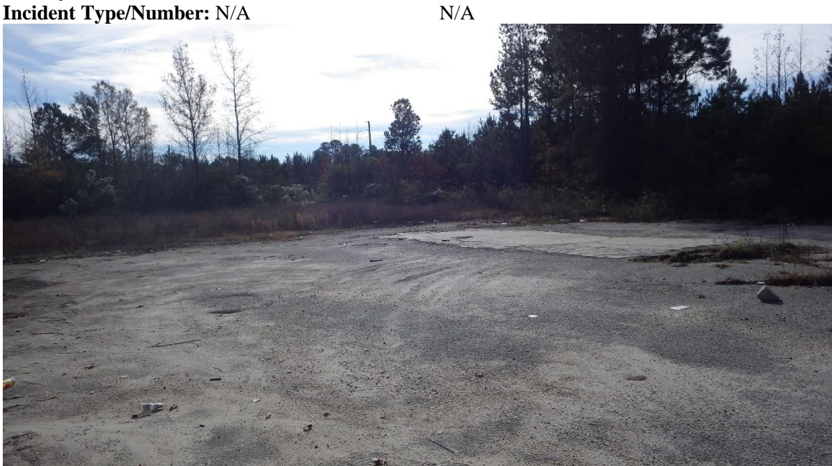
Anticipated Impacts: Low

This site is currently a vacant lot. It is located on the southeast side of US 301 at the I-95 South ramp. There is no physical address listed for this property. It is possible this was a gas station or repair shop at one time. There was no evidence of any USTs and no monitoring were observed during the site investigation.