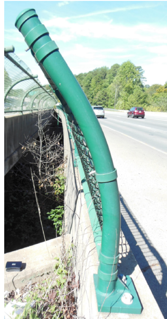
PIPE POST DETAIL