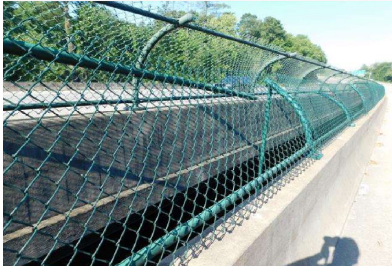
EXISTING FENCE DAMAGE

p:\gfn\p-w\ben\haley.com\gfn\p-w-01\Documents\Projects\67945\Phase 003 - I-5997 Rehab\Structures\CAD\2.0 100% Plans\403-017-15997-SMU_PSF_910263-910264_041 11/22/2021 9:21:16 AM pdf_color_gfclt_FS.plt Rowan.pen.tbl