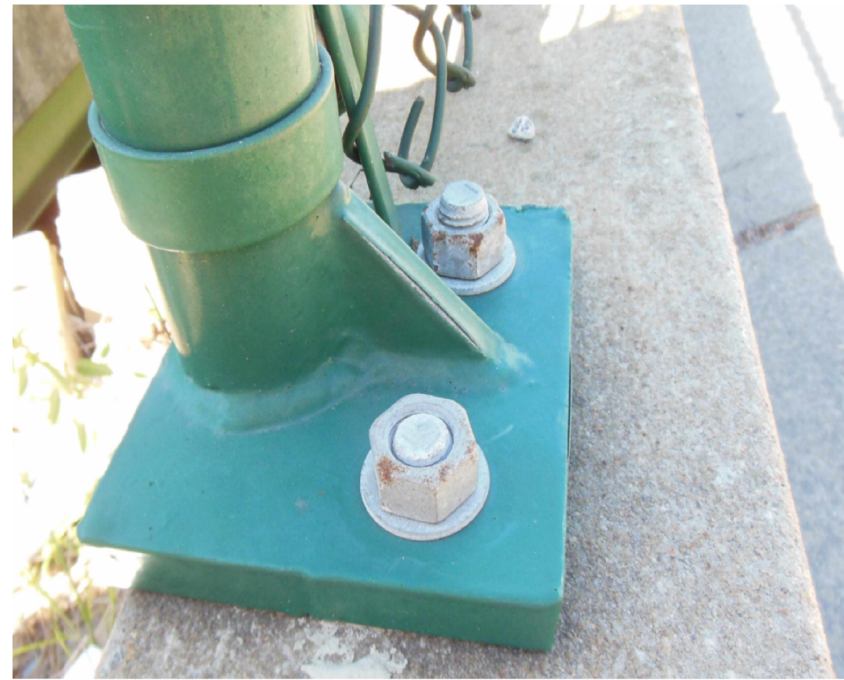
BASE PLATE DETAILS