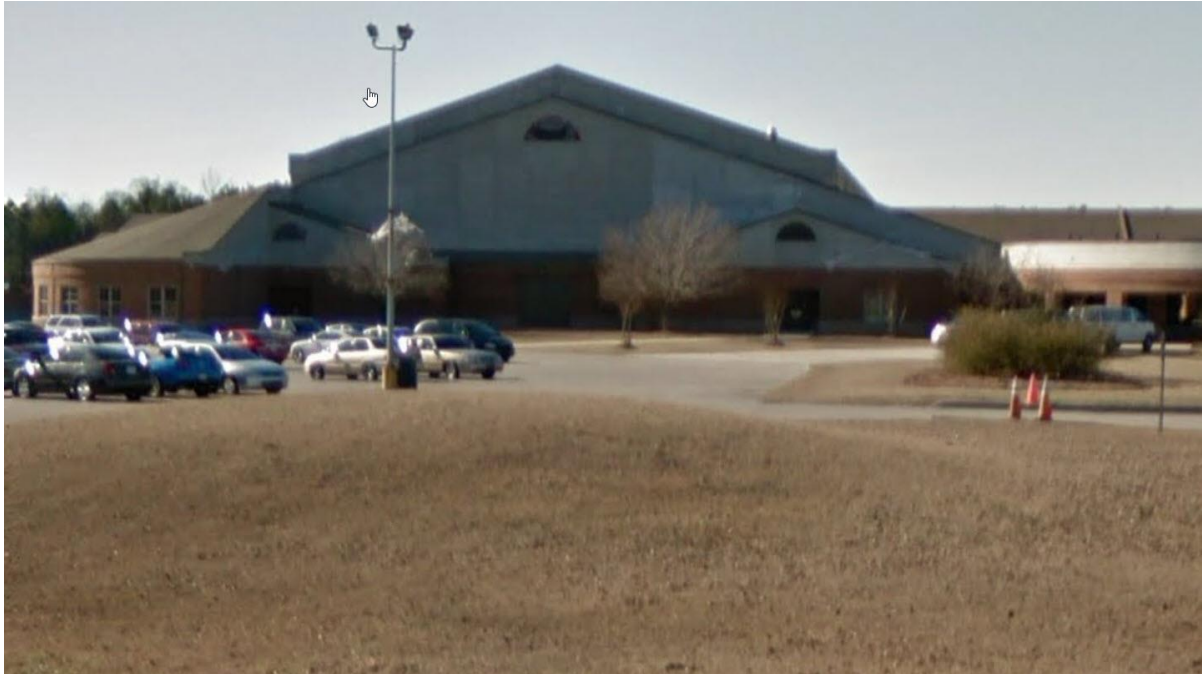
Photo taken from Google Street View.

Columbus Co. BD of Education PO box 729 Whiteville, NC 28472