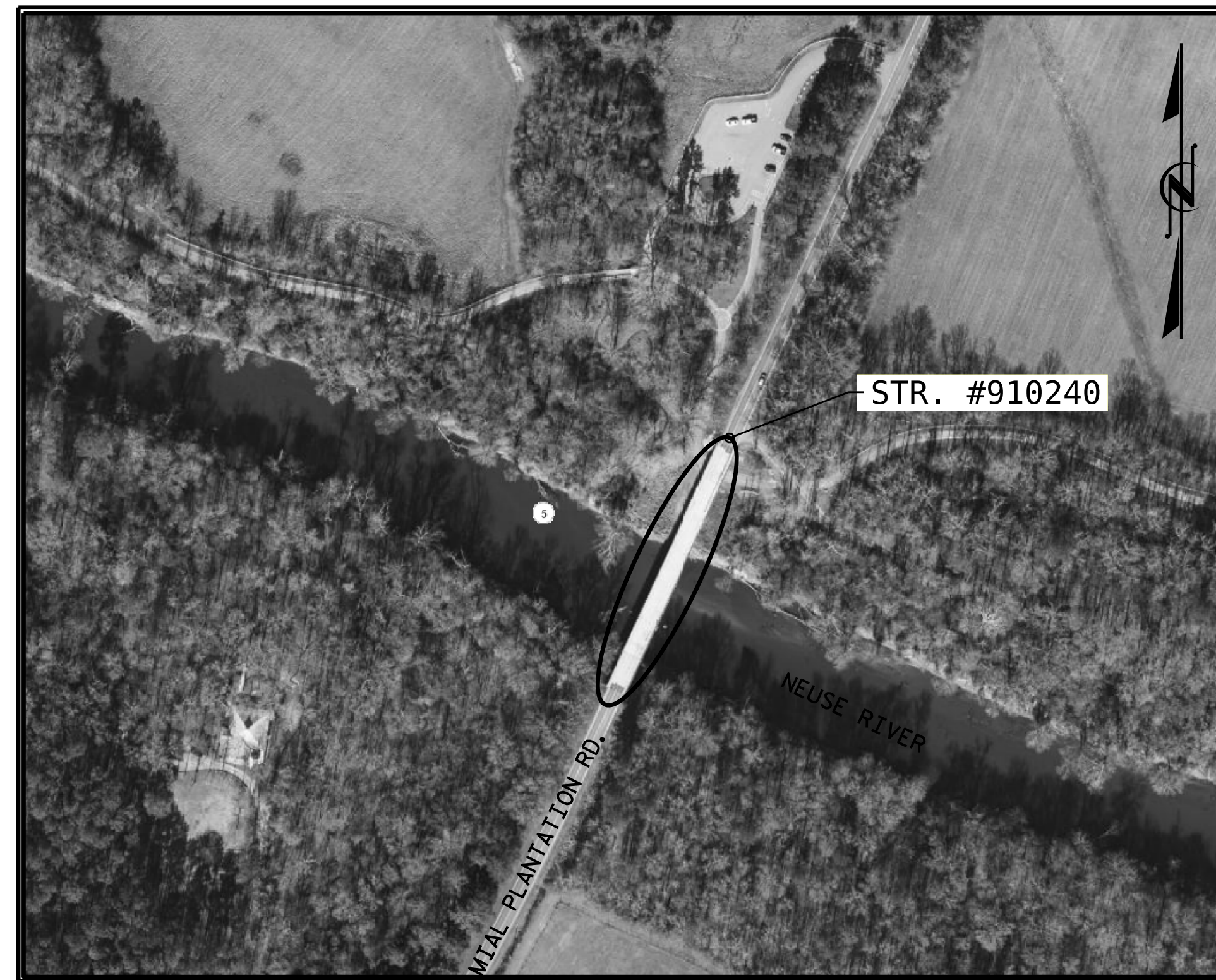
BRIDGE 910240 LOCATION SKETCH

PROJECT NO. 15BPR.49 WAKE COUNTY BRIDGE NO. 910028 & 910240