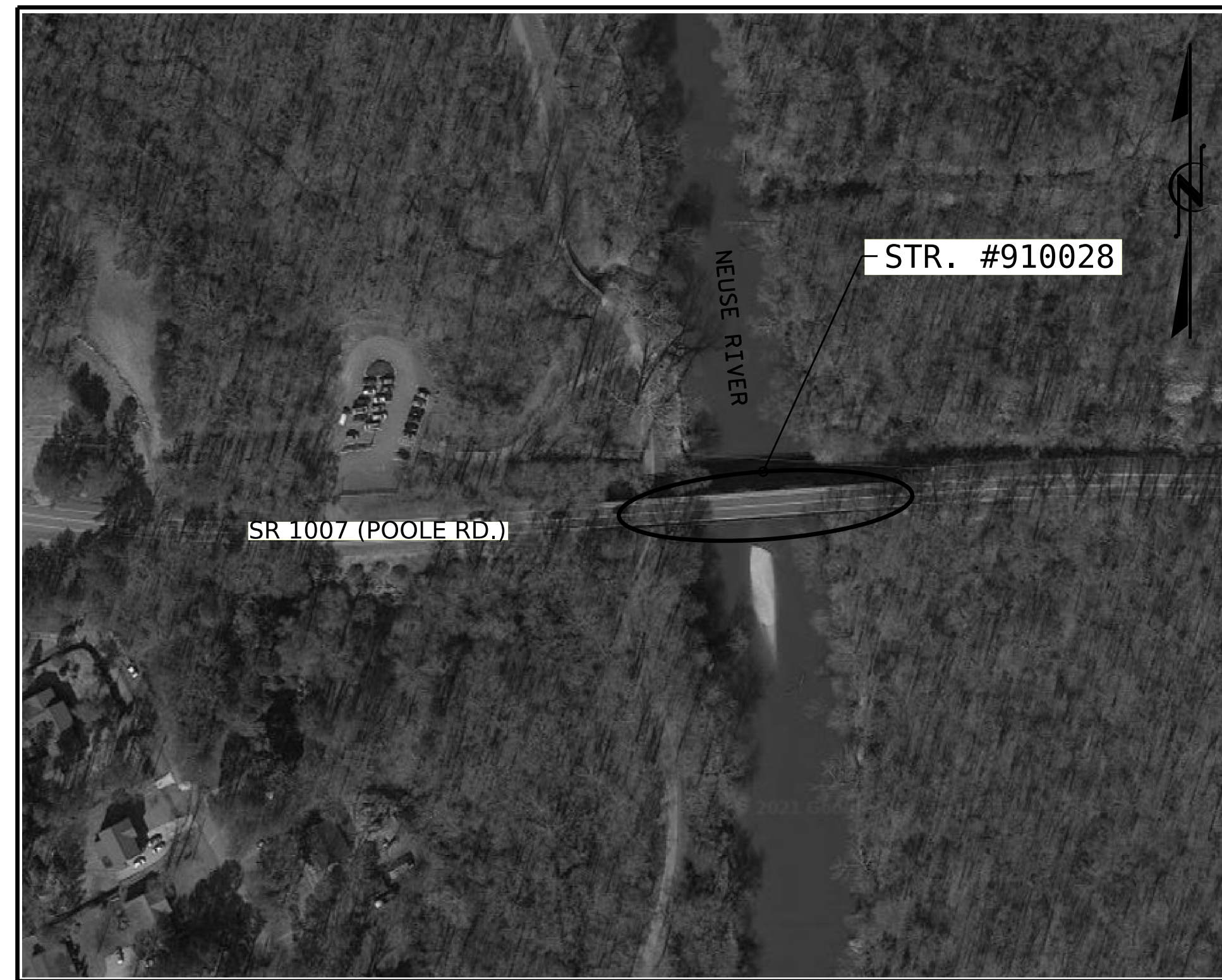
BRIDGE 910028 LOCATION SKETCH