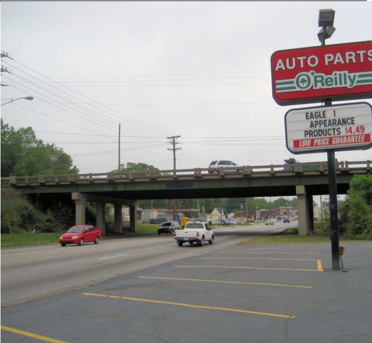
Bridge 147 on US 29/US70/I-85 BUS over US 311 (S. Main Street). View to the southeast.