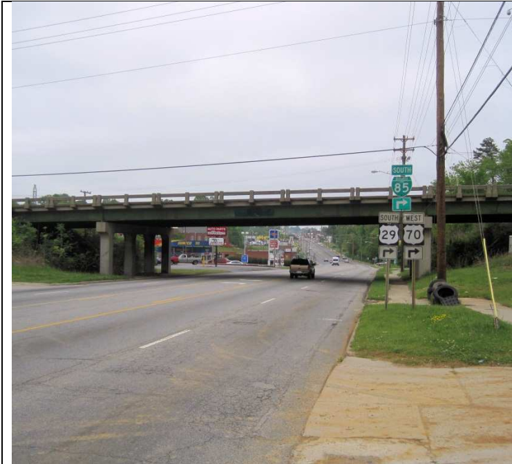
Bridge 147 on US 29/US70/I-85 BUS over US 311 (S. Main Street). View to the northwest.