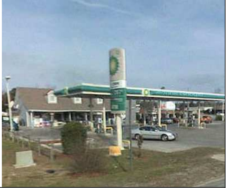
Site 30: C Store BP. View to the north.