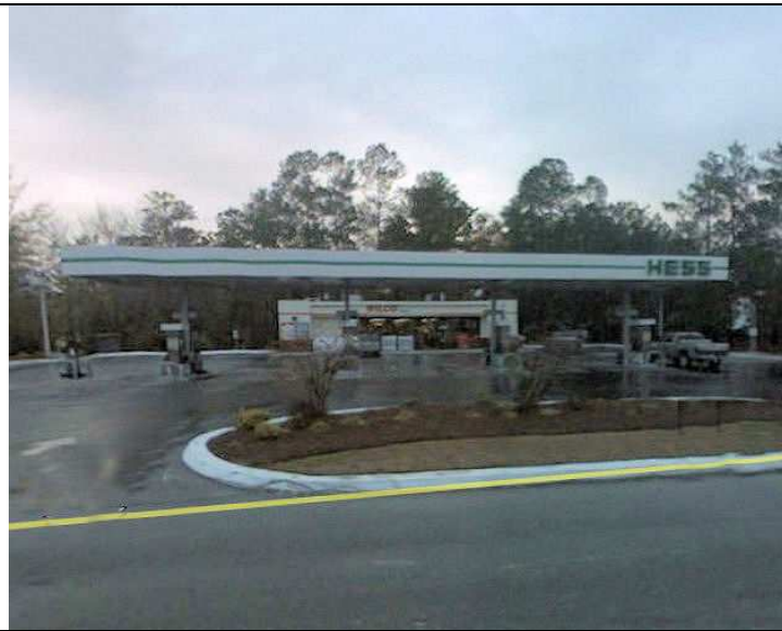
Site # 27: Wilco Hess #391. View to the northwest.