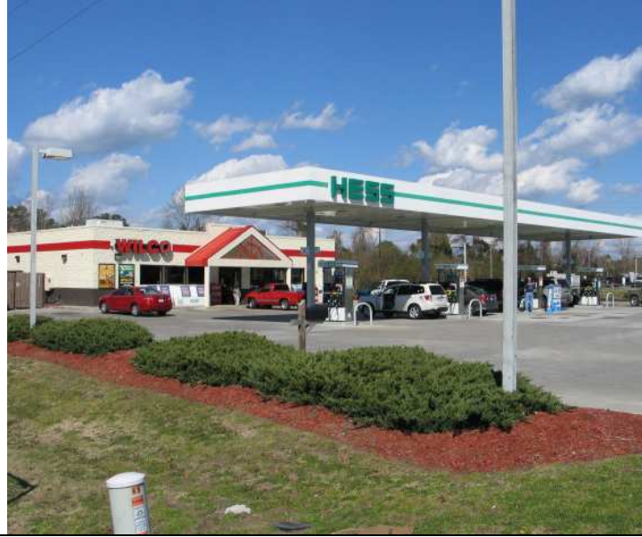
Site 29: Wilco Hess gas station. View to the north.