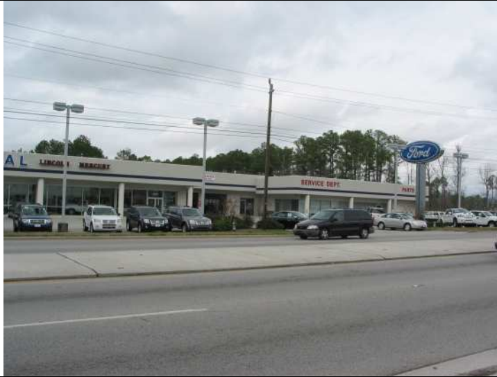
Site # 1: Capital Lincoln