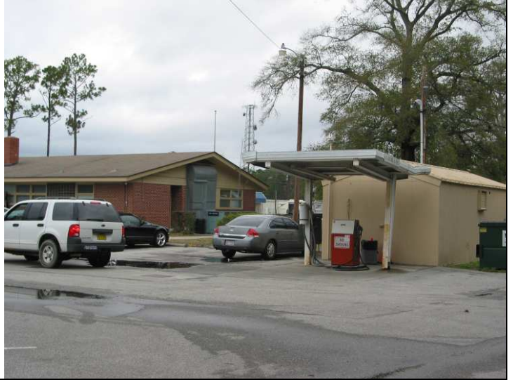
Site # 20: State Highway Patrol