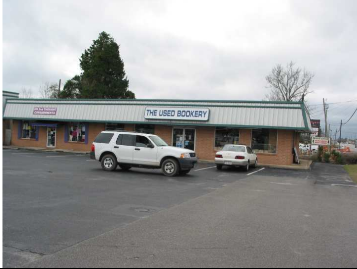
Site # 19: The Used Bookery