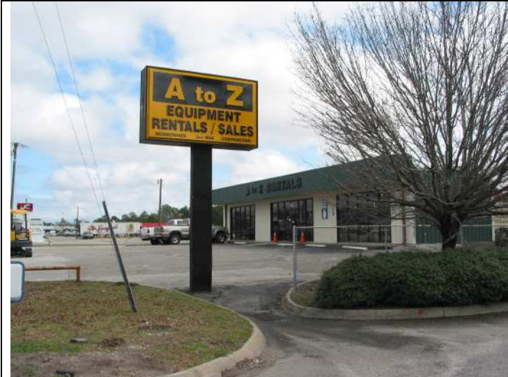
Site # 13: A to Z Equipment Rental