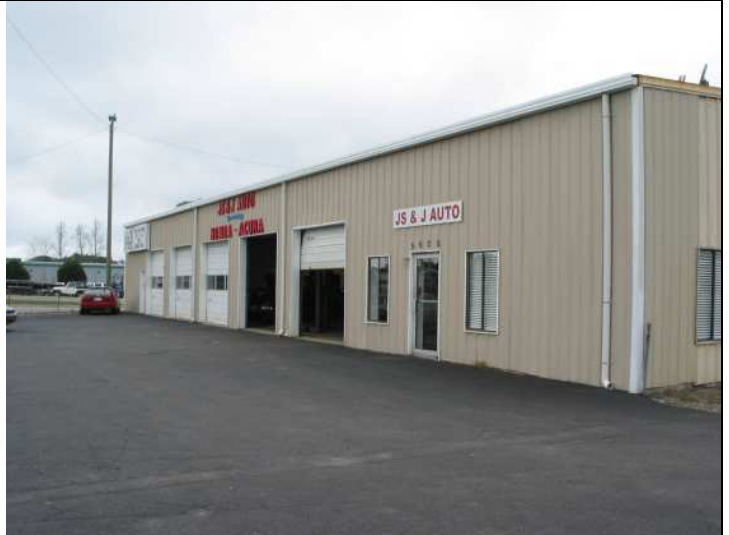
Site # 4: JS & J Auto