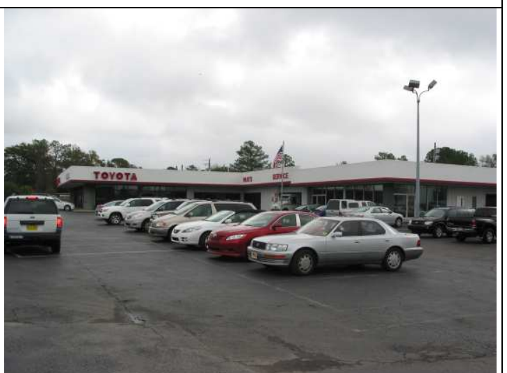
Site # 6: Cape Fear Toyota