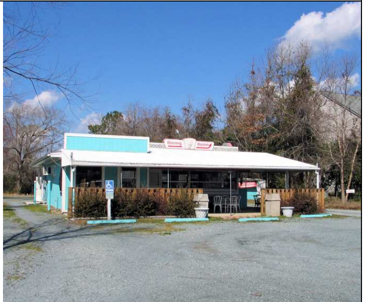
Site 32: Jeffy's Waterway Café. View to the north.