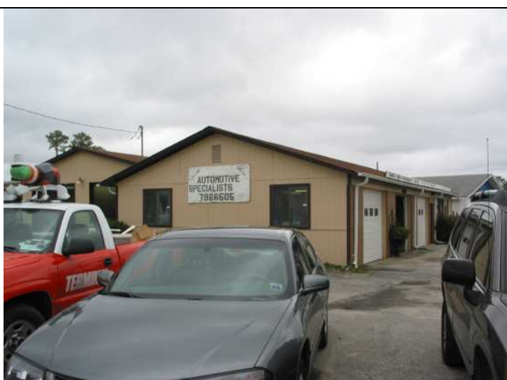
Site # 5: Tony's Auto Service