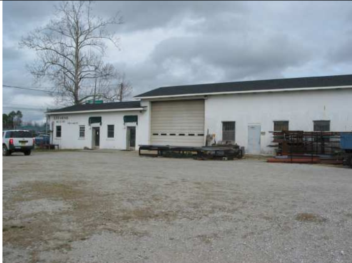
Site # 3: Stevens Fabrication & Welding