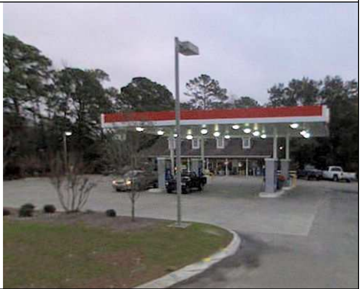
Site # 28: Coastal Outdoor Sports. View to the southeast.