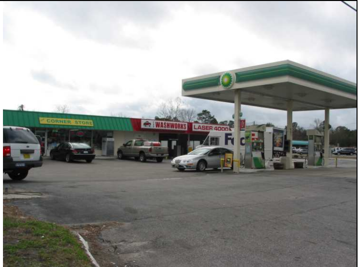
Site # 14: Valley Express (Our Corner Store)