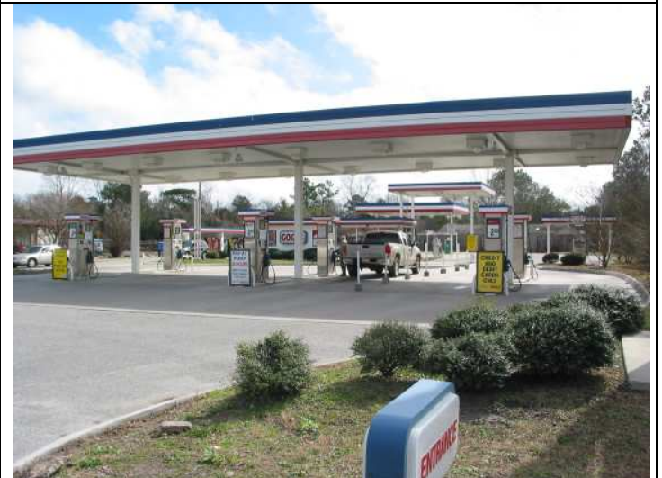
Site # 12: Gogas # 11