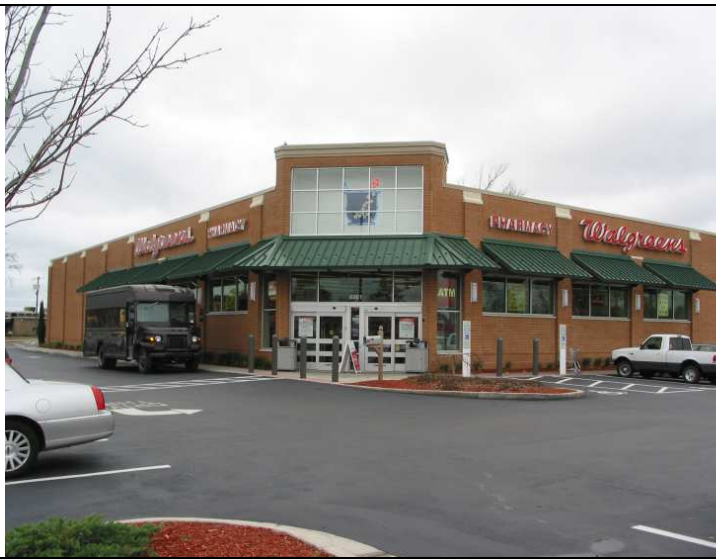
Site # 21: Walgreen's Drug Store.