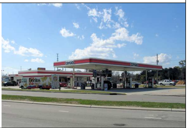
Site 24: Market Street Citgo. View to the southwest