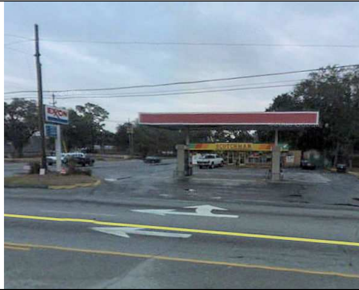
Site # 25: Scotchman #35. View to the southeast.