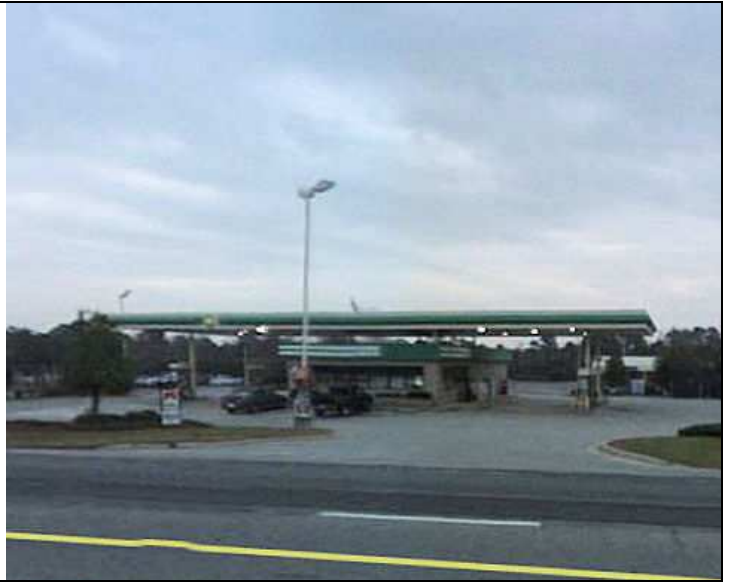
Site # 26: Gas Center #12. View to the southeast.