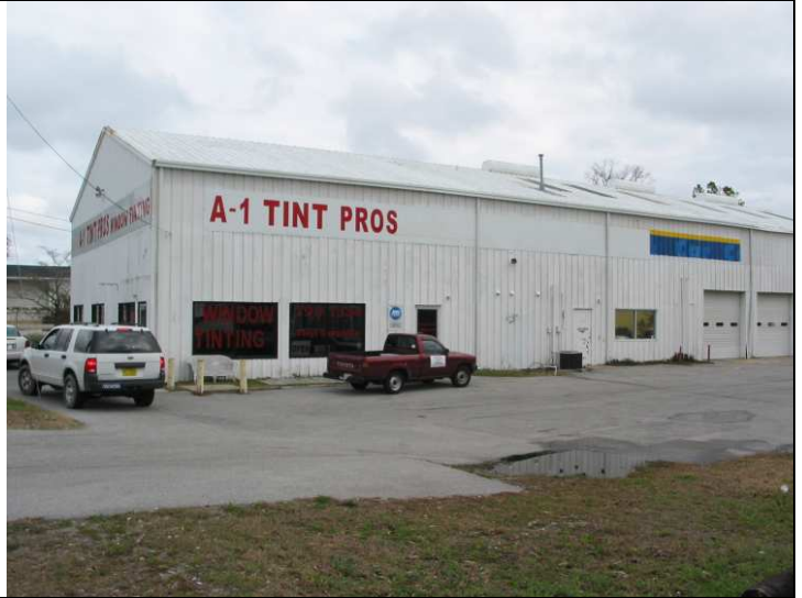
Site # 2: A-1 Tint Pros