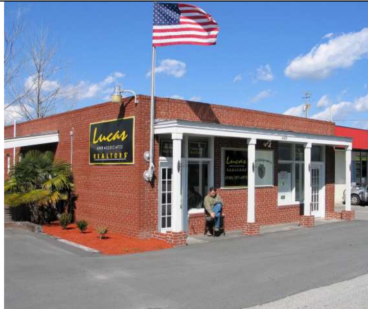
Site 31: Lucas & Associates Realtors. View to the north.