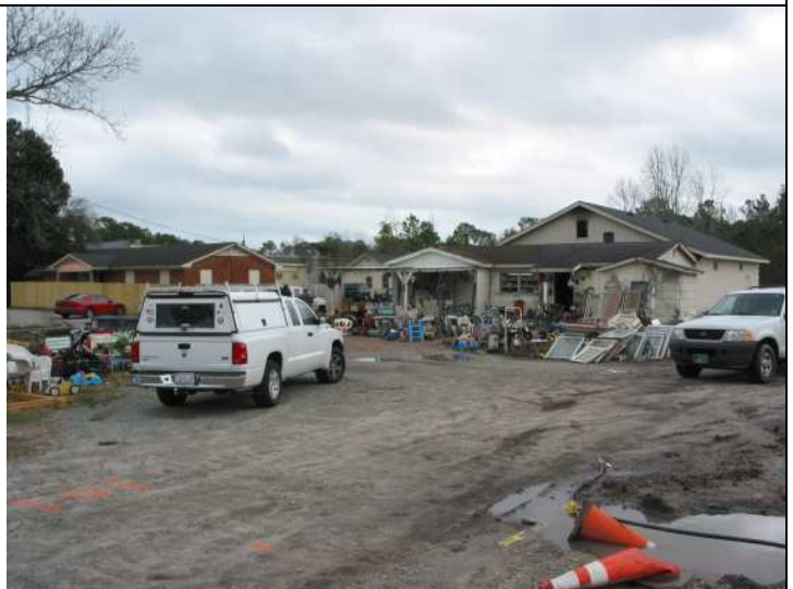
Site # 18: Thieves Market