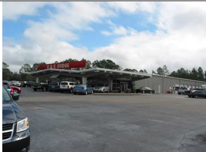
Site # 11: D & E Dodge