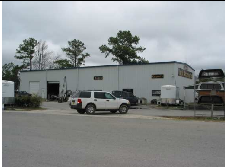
Site # 7: Leonard's