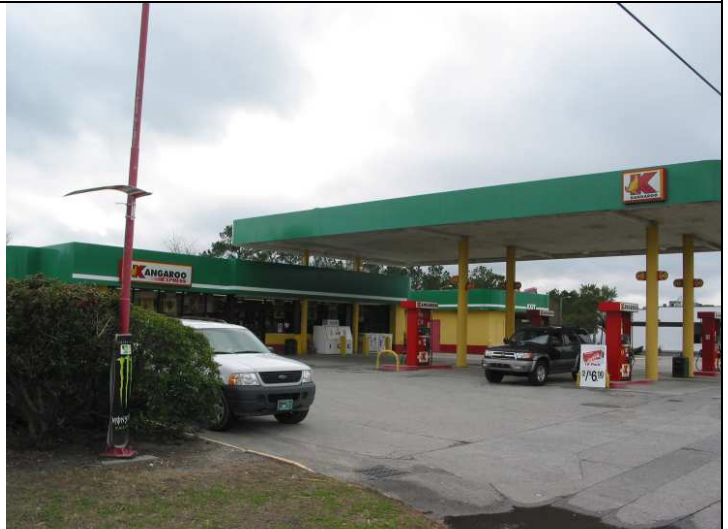
Site # 16: The Pantry # 3122