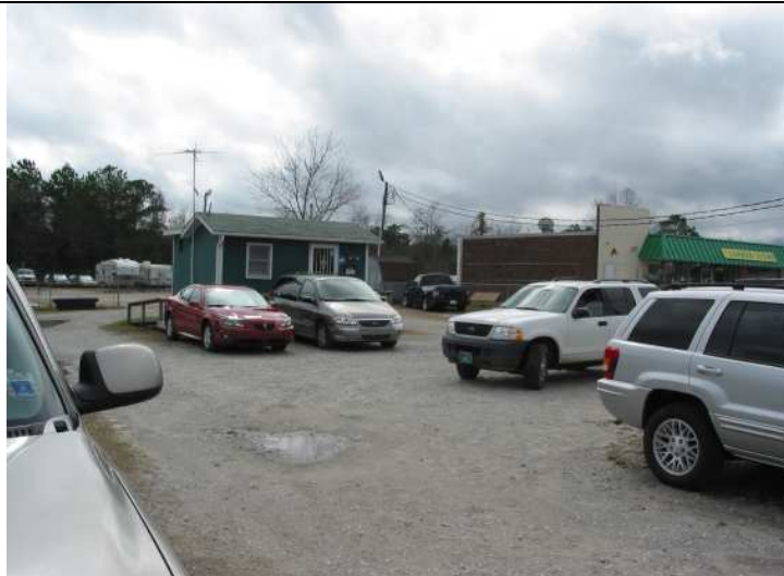
Site # 15: Jackson Motor Co