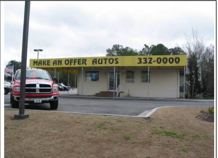
Site # 8: Make an Offer Auto