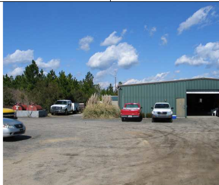
Site 35: Castle Bay Golf Course Maintenance Shop. View to the north.