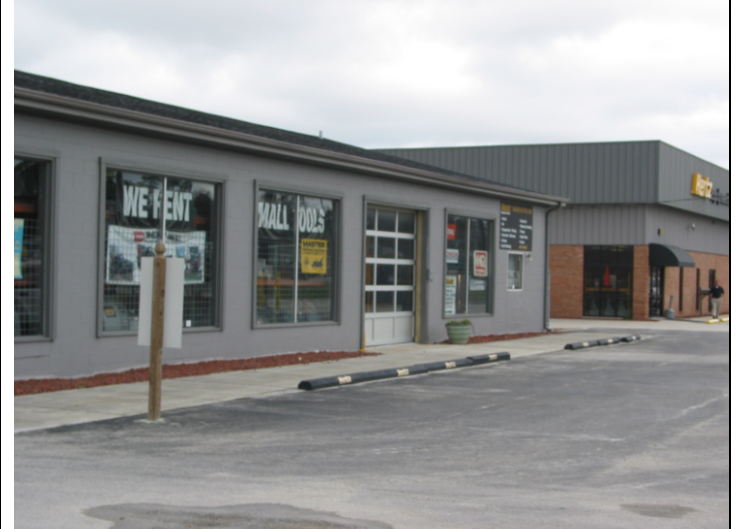
Site # 10: Hertz Equipment Rental