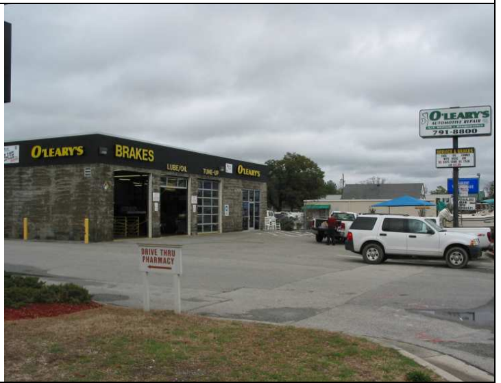
Site # 22: O'Leary's Auto Repair.