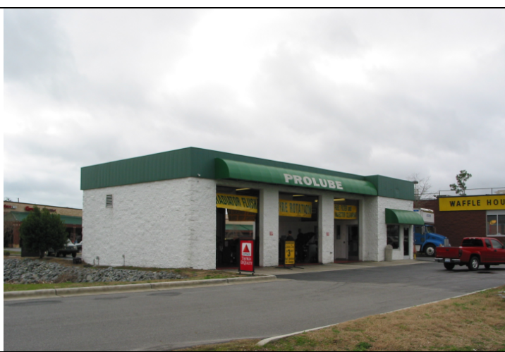
Site # 23: Pro Lube