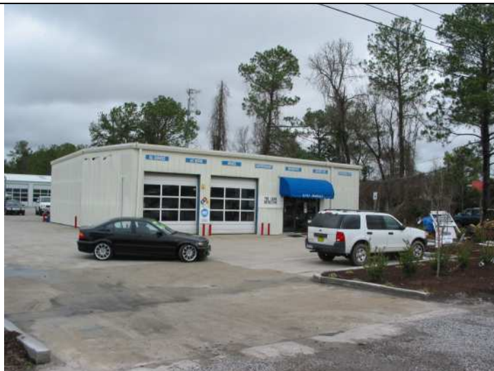
Site # 17: Kelly's Automotive