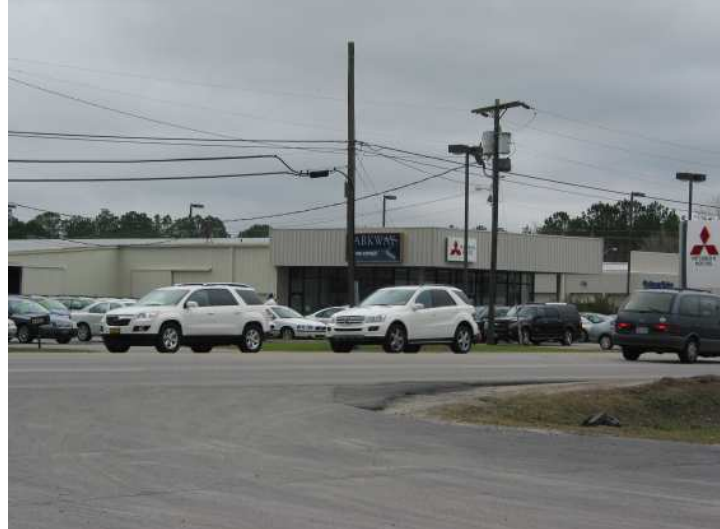
Site # 9: Parkwood Preowned