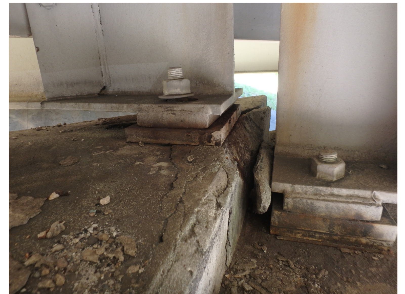
TYPICAL PEDESTAL CONDITION

FOR BRIDGE JACKING, SEE "JACKING DETAILS" SHEETS AND SPECIAL PROVISIONS. CLEAN AND PAINT BEARING ASSEMBLY STEEL PRIOR TO RELEASING JACKS. ONLY CUT ANCHOR RODS IN SPANS 1 AND 4, ON INTERIOR BEAMS ONLY. FOR CFRP PEDESTAL REPAIRS AND BEARING RETROFIT, SEE SPECIAL PROVISIONS. FOR PEDESTAL REPAIR LOCATIONS, SEE "SUBSTRUCTURE REPAIR" SHEETS. PERFORM ALL SUBSTRUCTURE CONCRETE REPAIRS PRIOR TO JACKING AND PRIOR TO PERFORMING PEDESTAL REPAIRS.