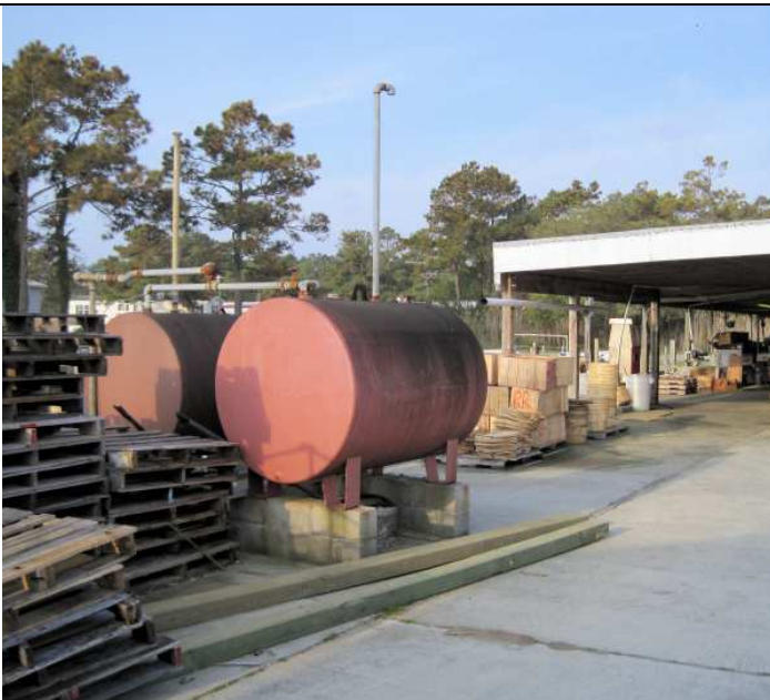
Site 2: Billy's Seafood ASTs and dispenser. View to the southwest.