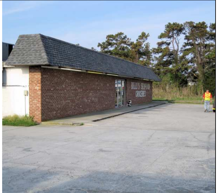
Site 2: Billy's Seafood & Groceries. View to the southwest.