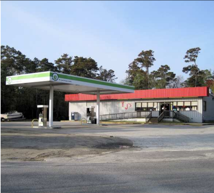
Site 1: TJ's Gas & Grill. View to the northwest.