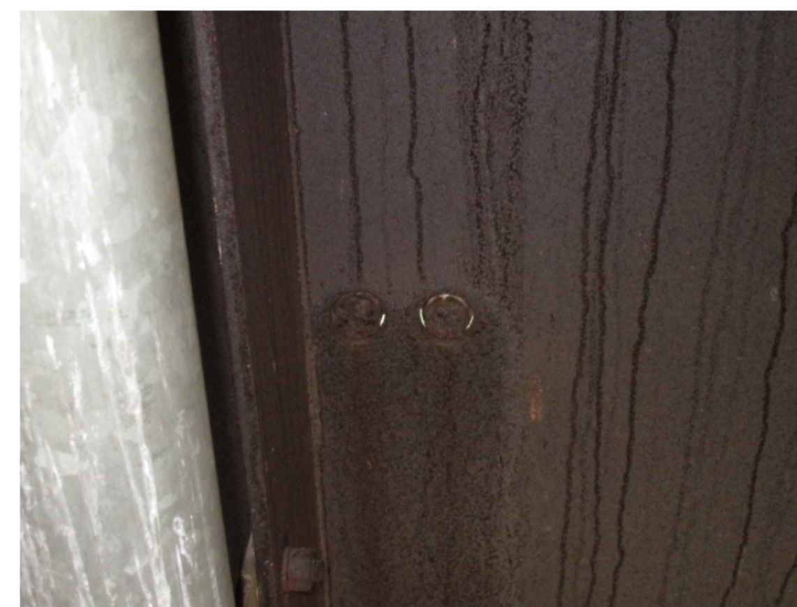
PHOTO LOCATION LEGEND