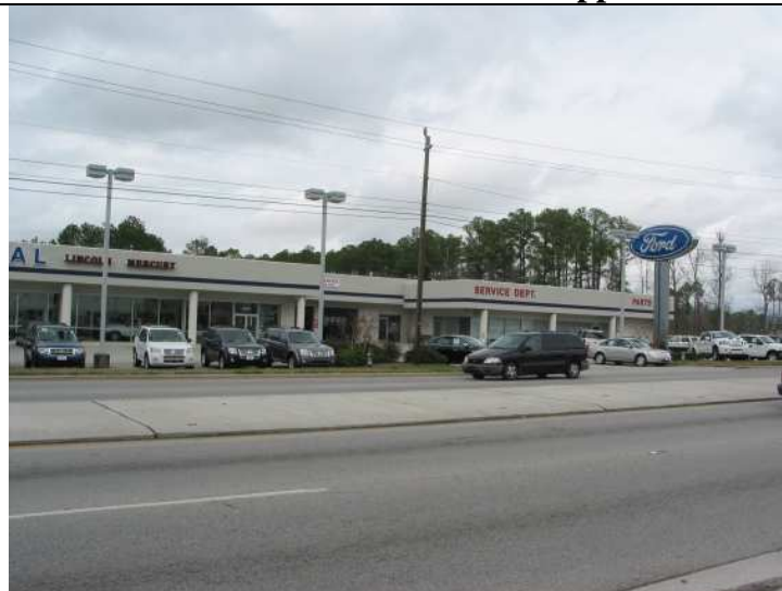
Site # 1: Capital Lincoln