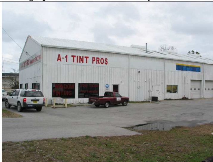
Site # 2: A-1 Tint Pros