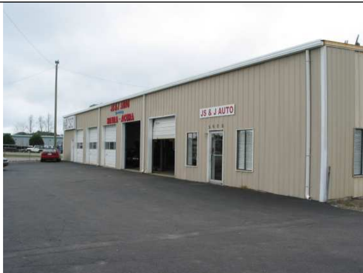
Site # 4: JS & J Auto