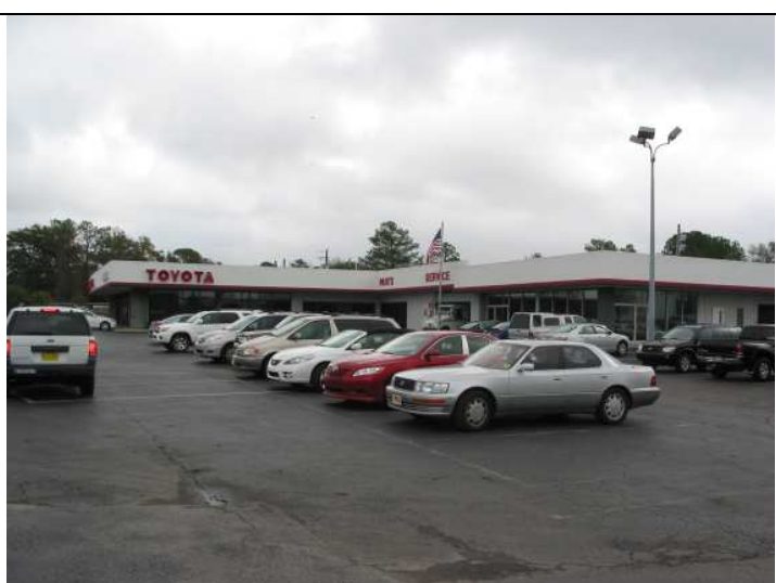
Site # 6: Cape Fear Toyota