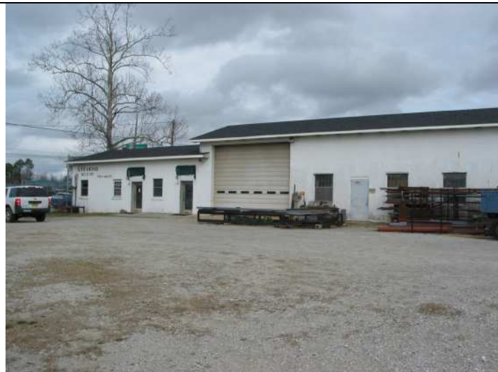
Site # 3: Stevens Fabrication & Welding