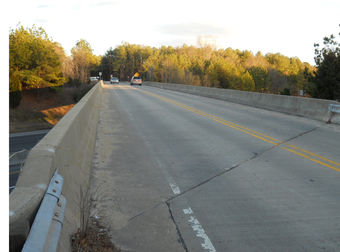
SR-2220 OVER I-40