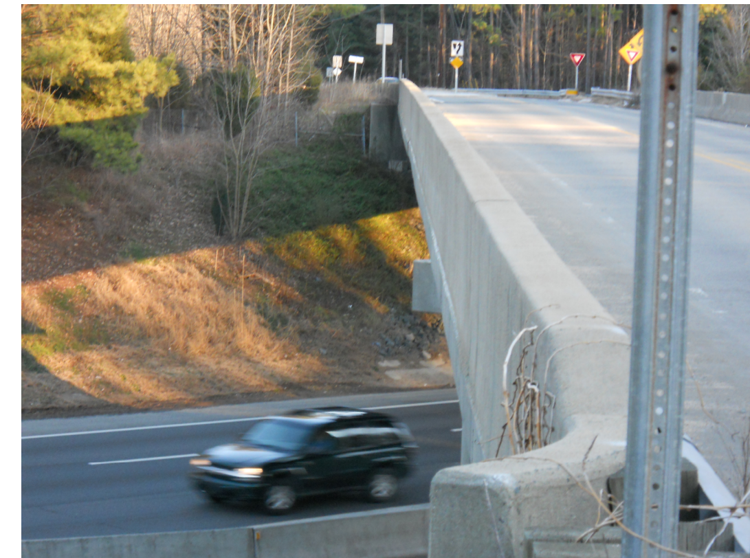
SR-2220 OVER I-40

PROJECT NO. EB-4707B DURHAM COUNTY STATION: N/A