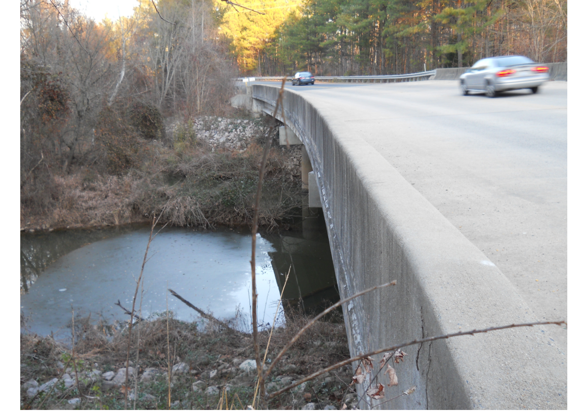
SR-2220 OVER NEW HOPE CREEK