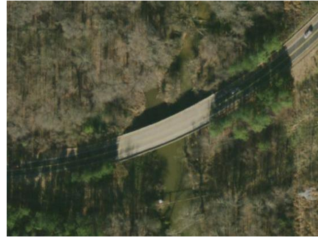
SR-2220 OVER NEW HOPE CREEK