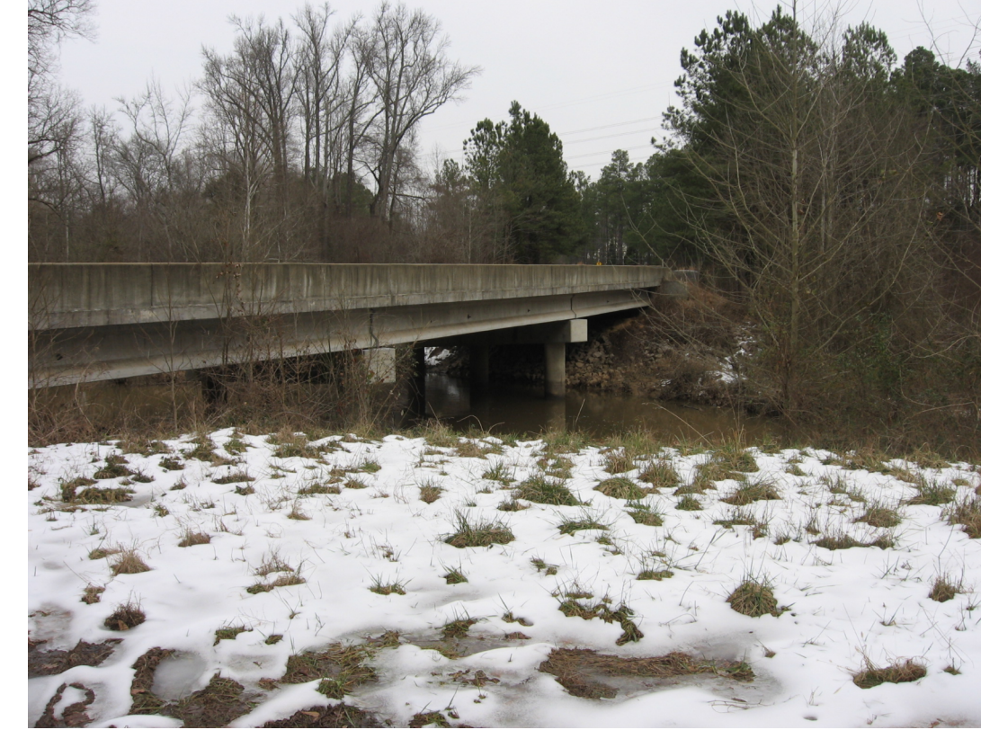
SR-2220 OVER NEW HOPE CREEK