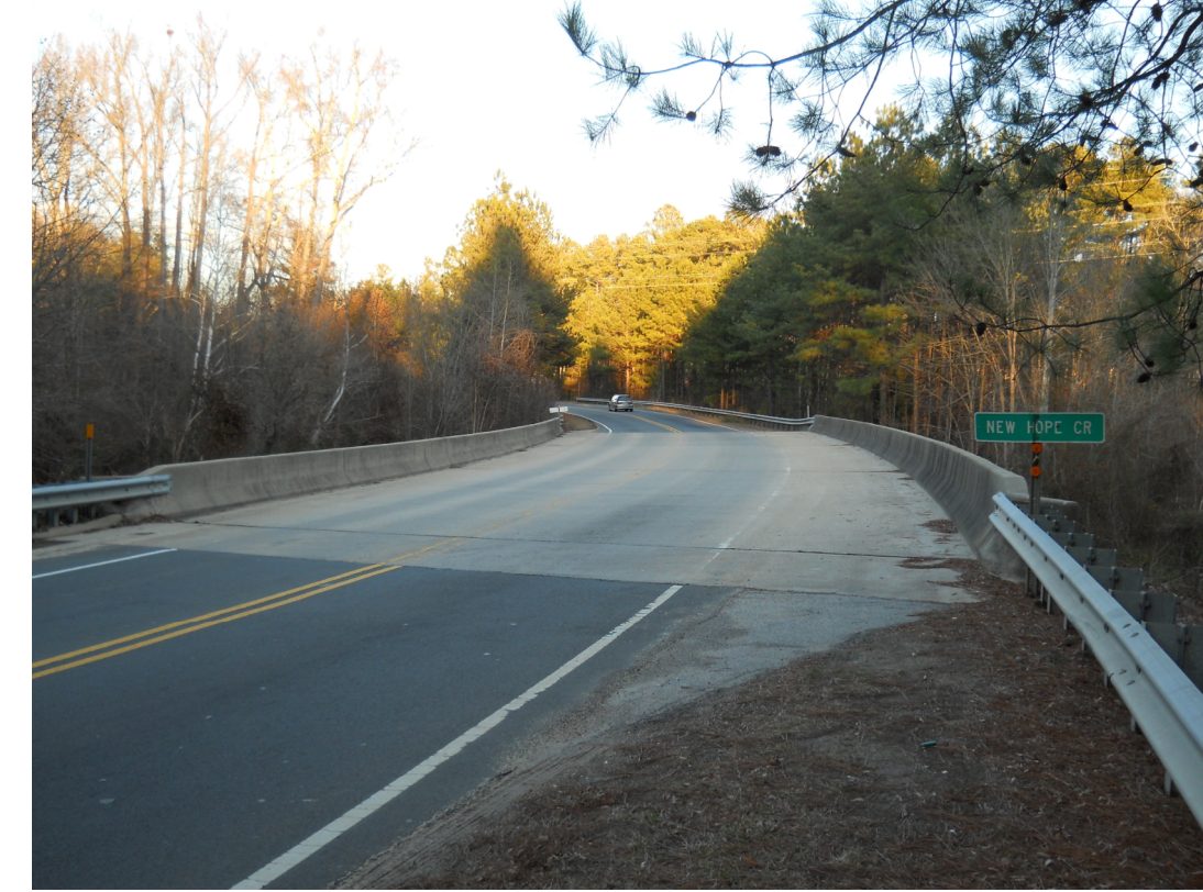
SR-2220 OVER NEW HOPE CREEK