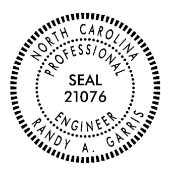
State Contract Officer

Accompanying this bid is a bid bond secured by a corporate surety, or certified check payable to the order of the Department of Transportation, for five percent of the total bid price, which deposit is to be forfeited as liquidated damages in case this bid is accepted and the Bidder shall fail to provide the required payment and performance bonds with the Department of Transportation, under the condition of this proposal, within 14 calendar days after the written notice of award is received by him, as provided in the Standard Specifications ; otherwise said deposit will be returned to the Bidder.