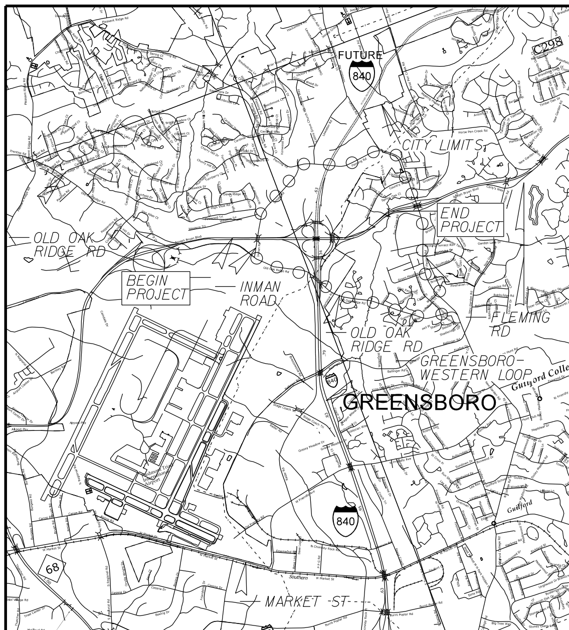
VICINITY MAP ○—○—○ DETOUR ROUTE

TYPE OF WORK: GRADING, DRAINAGE, PAVING, ITS, AND STRUCTURES