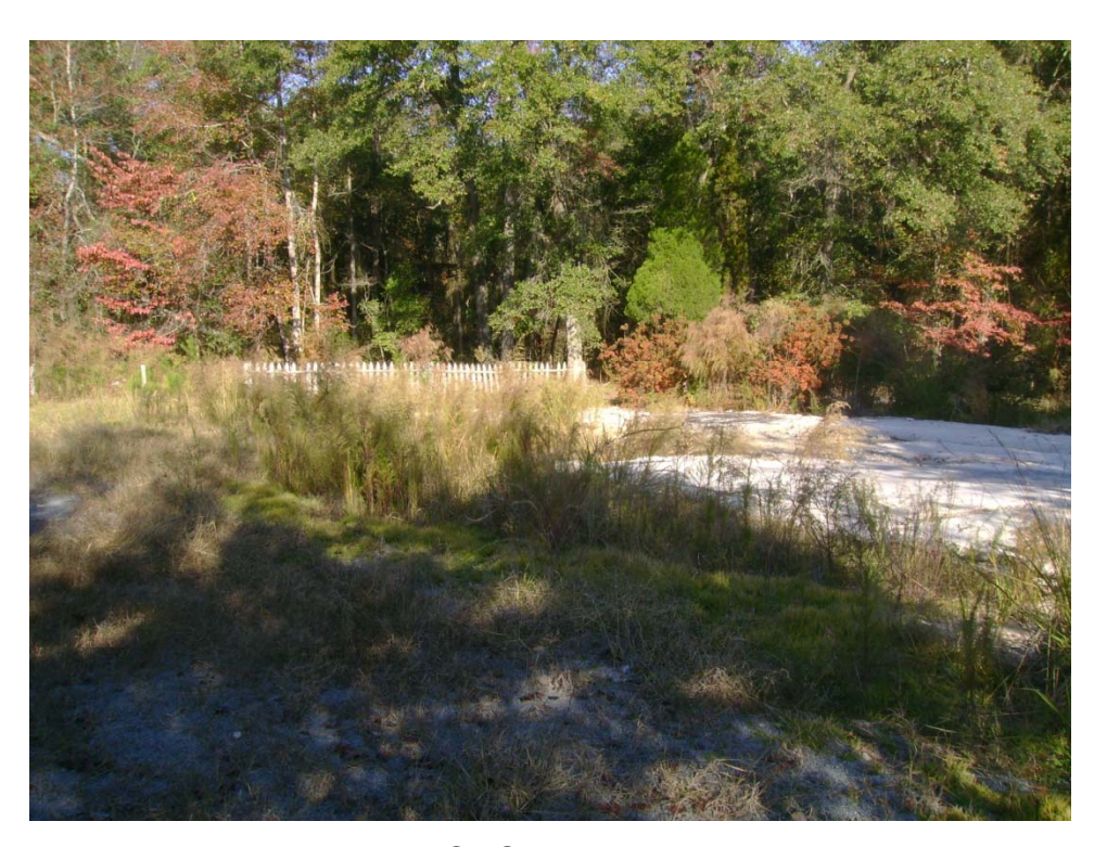
Parcel 902 - NCDOT Property, looking north