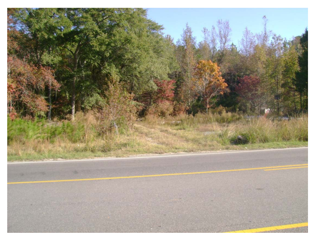
Parcel 902 – NCDOT Property, looking northeast