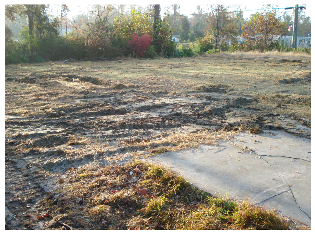
Photograph 3: View looking south at UST excavation following backfilling and compaction.