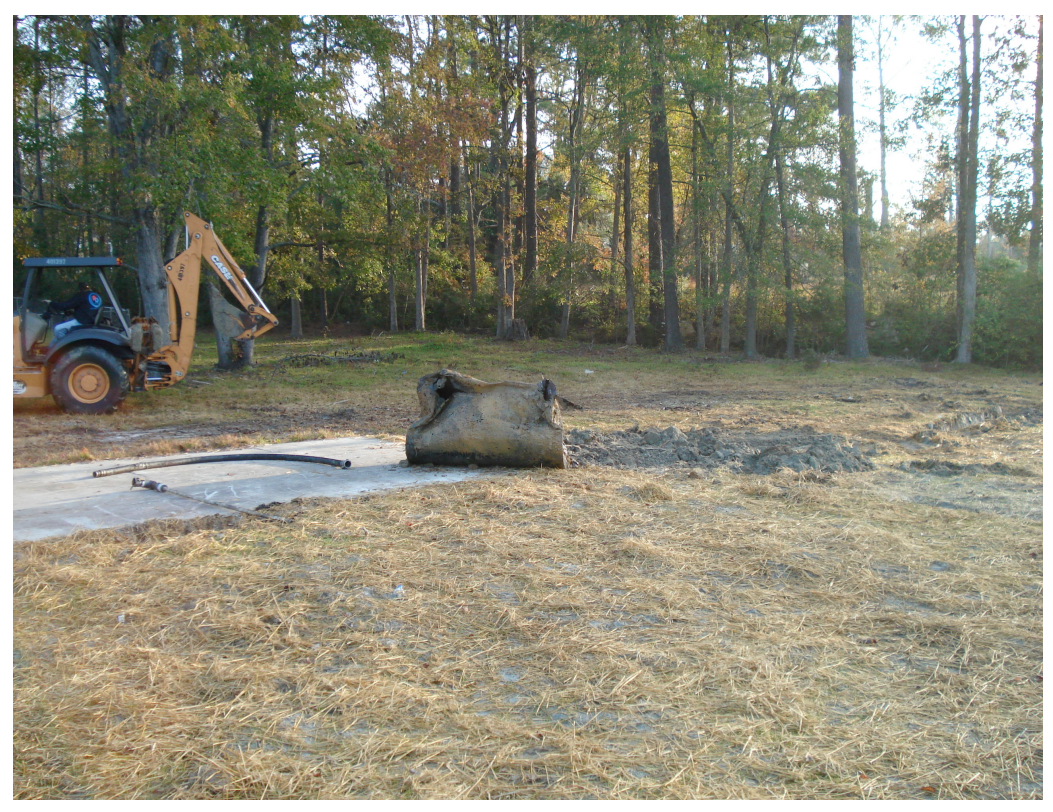
Photograph 2: View looking east at heating oil UST following removal.