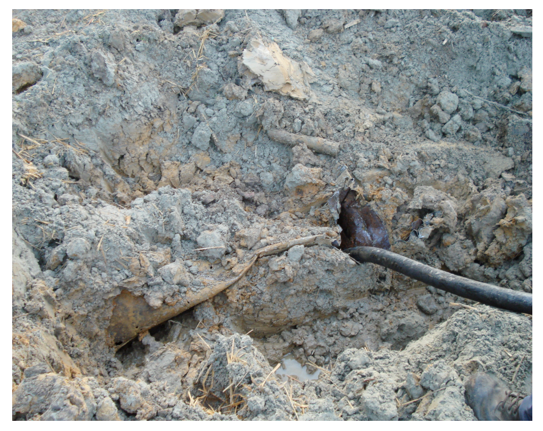
Photograph 1: Withdrawal of UST contents through hole created by contractor prior to UST removal.