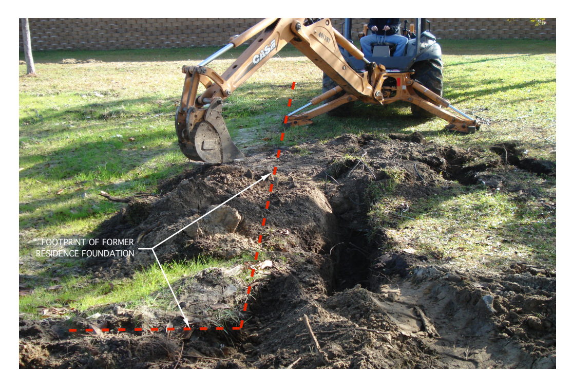
Photograph 2: View looking east at beginning of excavation activities along south side of former residence foundation.