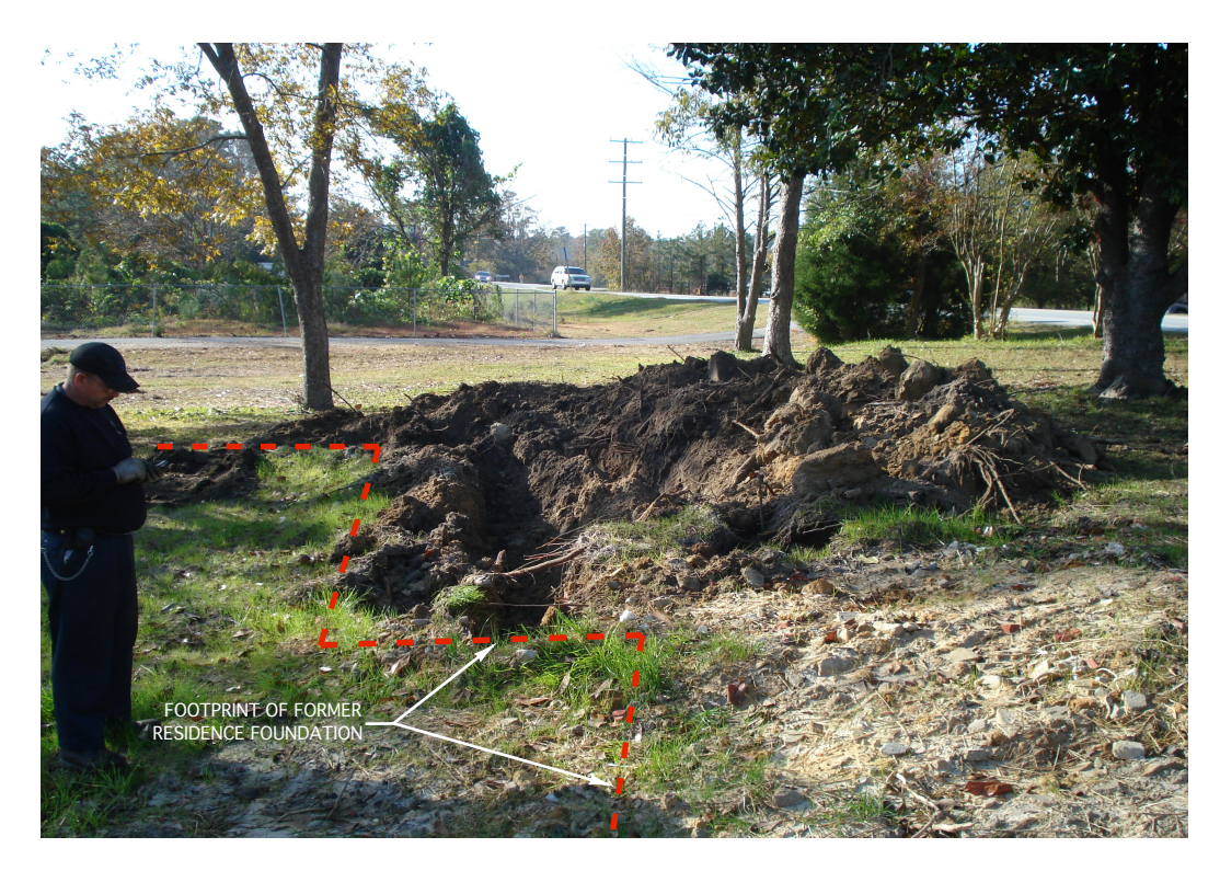
Photograph 3: View looking south at completion of excavation activities.