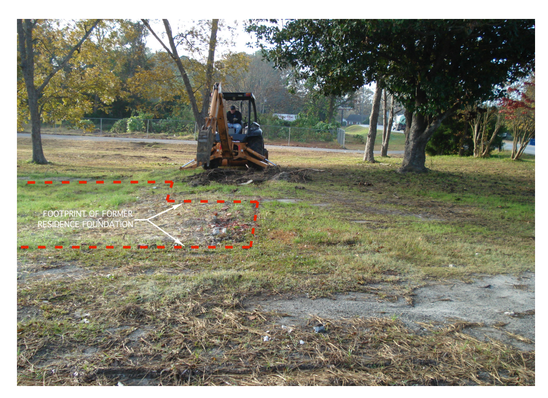
Photograph 1: View looking south at beginning of excavation activities along southwest corner of former residence.