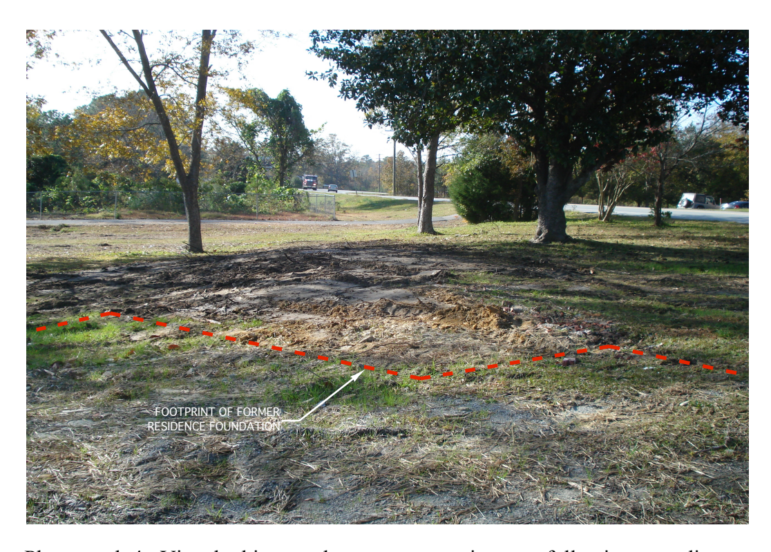
Photograph 4: View looking southwest at excavation area following regrading.