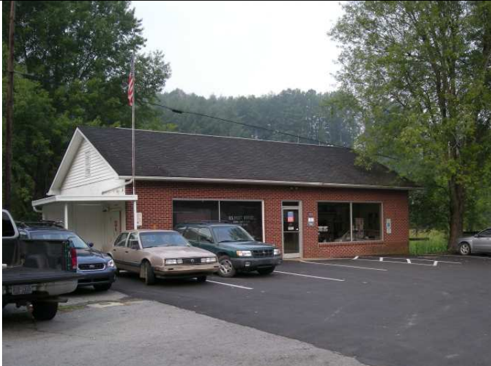
Site 1A: Sugar Grove Post Office. View to the southwest.