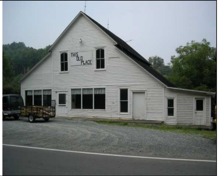
Site 4: This Old Place Store. View to the West.