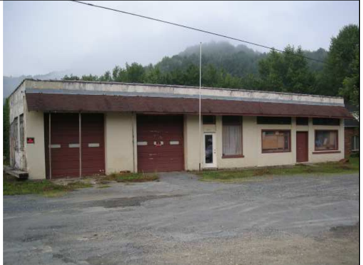
Site 1B: Vacant gas station. View to the southwest.