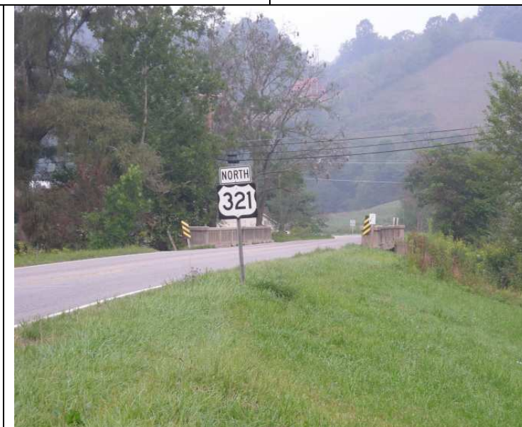
BR 29 on US 321. View to the East.