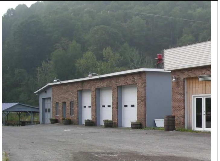
Site 2B: Mountaineer Ruritan Club building. View to the southeast.