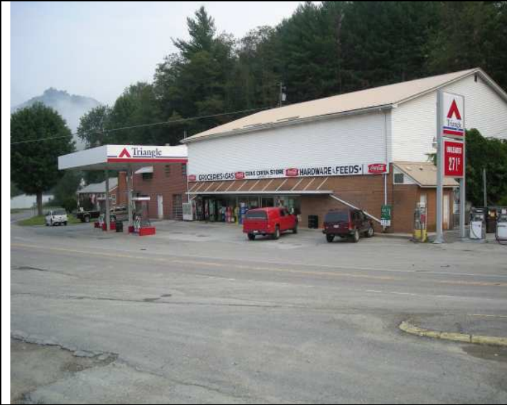
Site 3: Cove Creek Store. View to the North.