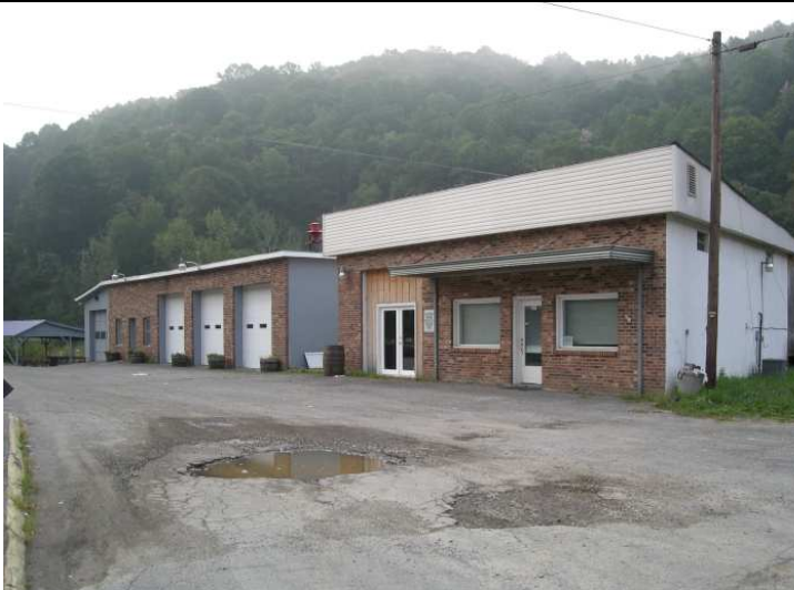
Site 2A: Vacant auto service garage in foreground. View to the southeast.