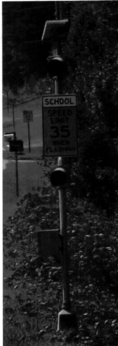
Figure 2: Southbound School Flasher