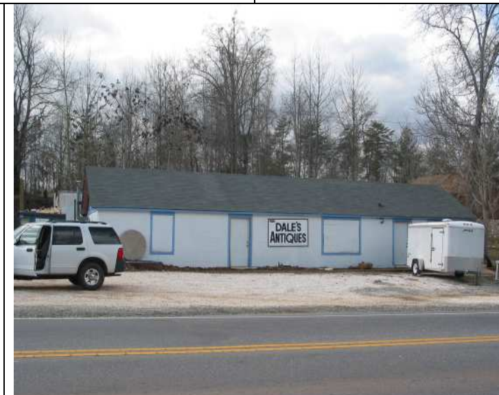
Site 7: Dale's Antiques. View to the southwest across NC 18.