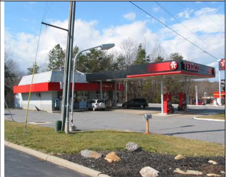
Site 4: Southern Convenience Texaco gas station. View to the east.