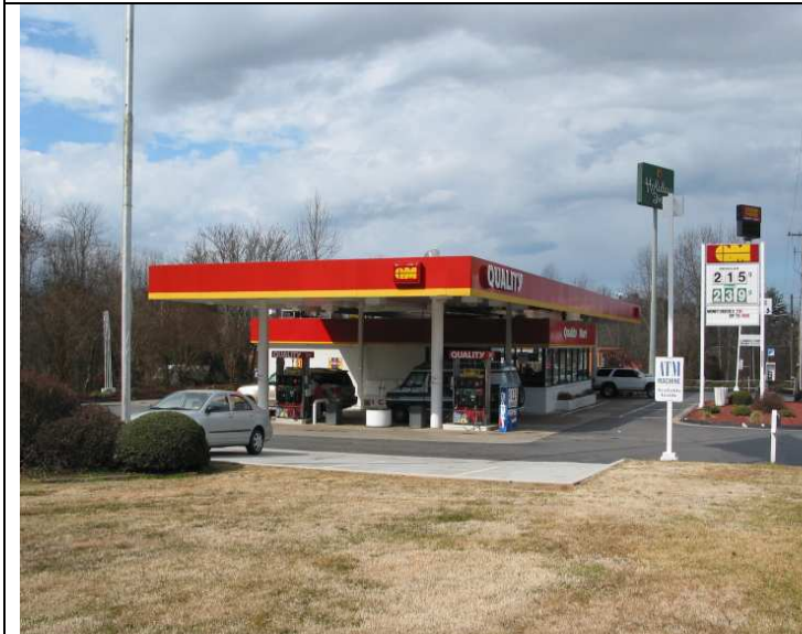
Site 3: Quality Mart 22 gas station. View to the southeast.