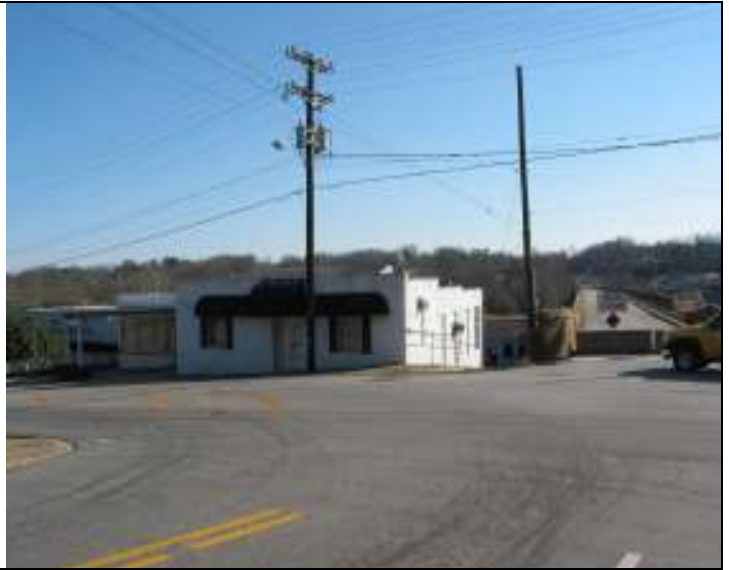
Site 1: Tender Touch Home Care