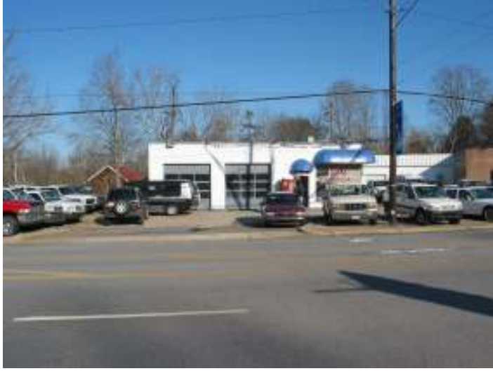
Site 5: N&W Auto Sales