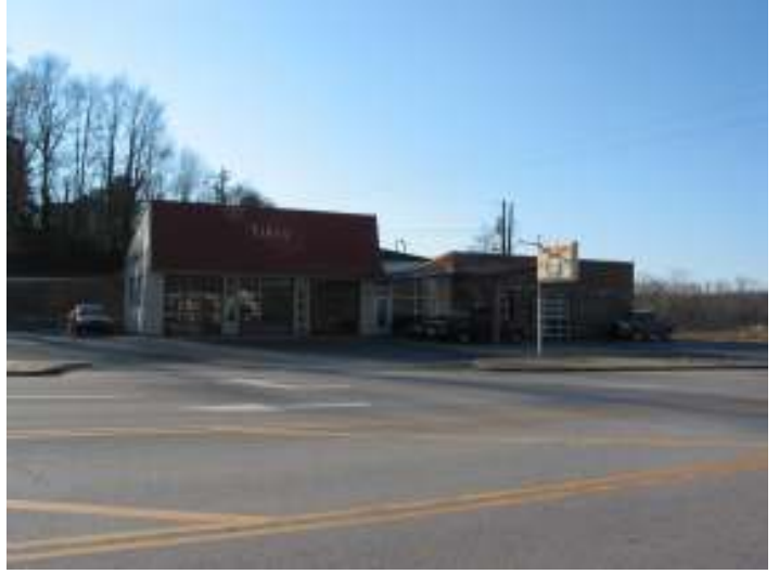
Site 6: Auto Glass Service