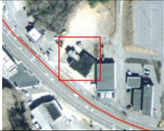
Site 9: Beroth Oil Co ( Jonesville Amoco)