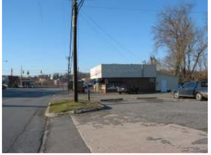
Site 8: Southern Bells