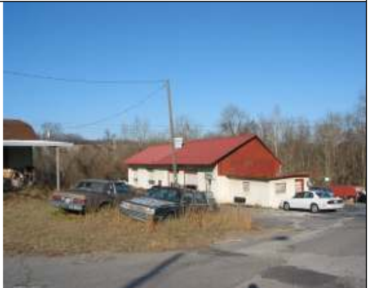
Site 3: Yadkin River RR