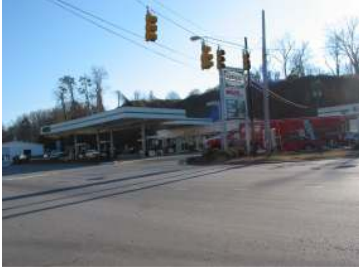
Site 7: Hess/ Wilco