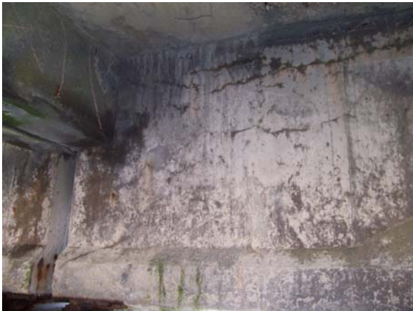
Span 117; East elevation