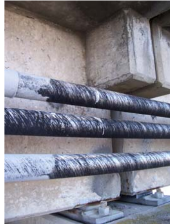
Span 32; east elevation