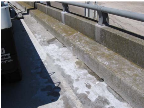
Span 116-117, Midspan deck core