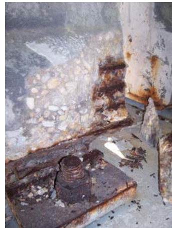
Span 93; East elevation