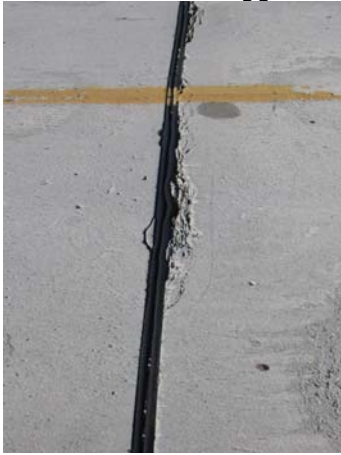
Span 117; deck surface