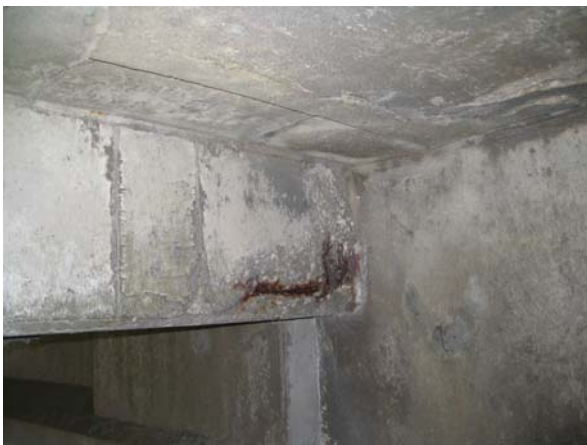
Span 176, deck soffit; south