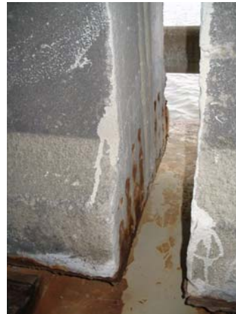
Span 176; Girder