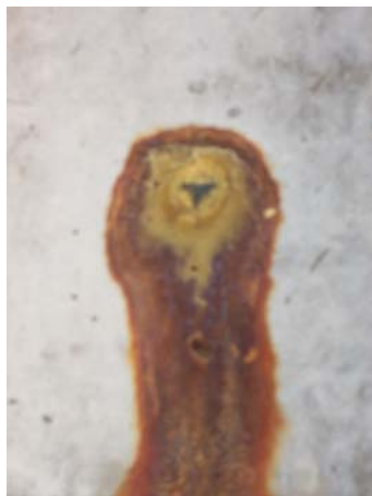
Span 93; West elevation