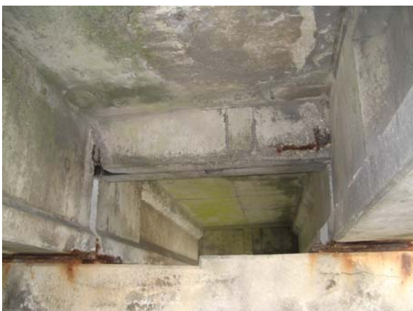
Span 176; deck soffit; south