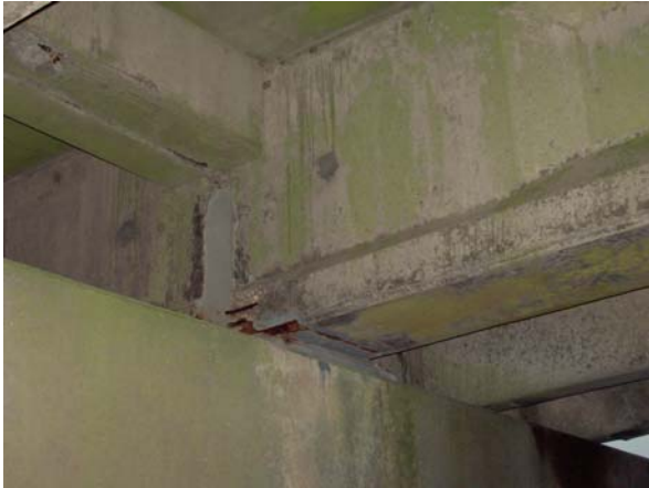
Bent 5, Girder #1: SP & ES south face