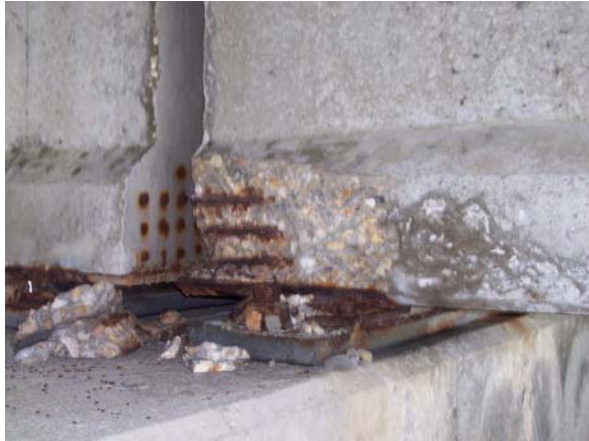
Span 65; West elevation