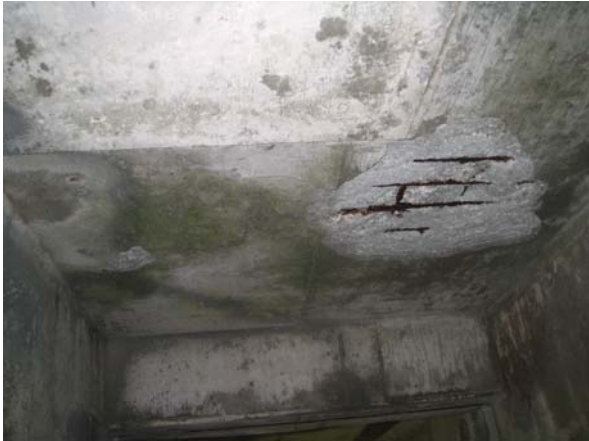
Span 176; deck soffit