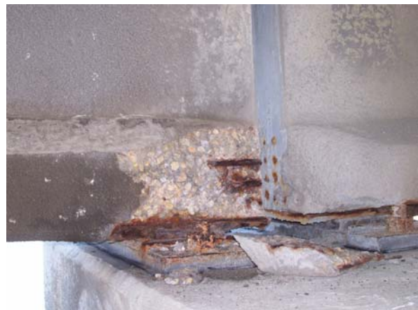
Span 54; East elevation