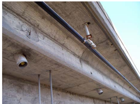
Span 48; deck soffit