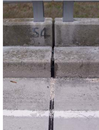
Span 54; deck surface