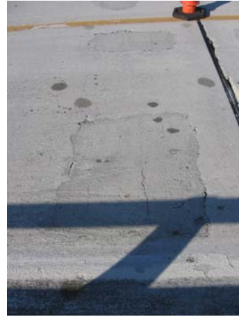
Span 117; deck surface