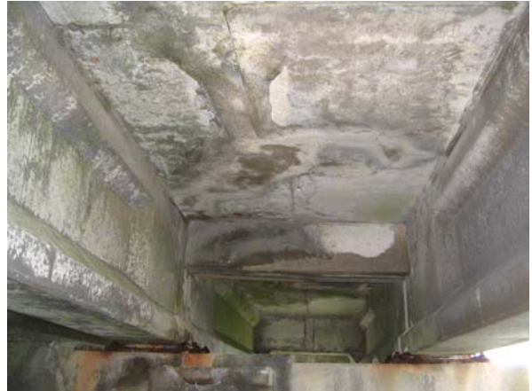
Span 176; deck soffit; north