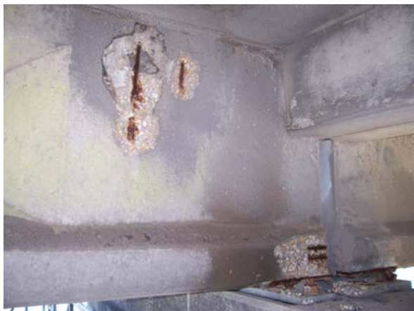
Span 54; East elevation