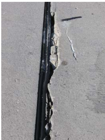
Span 116; deck surface; bad raveled edge