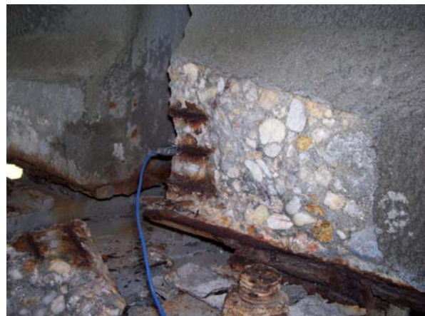
Span 54, West elevation