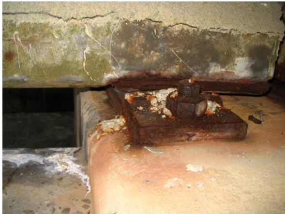
Span 176; East elevation; close up of BRNG