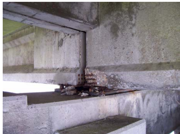
Span 65; West elevation