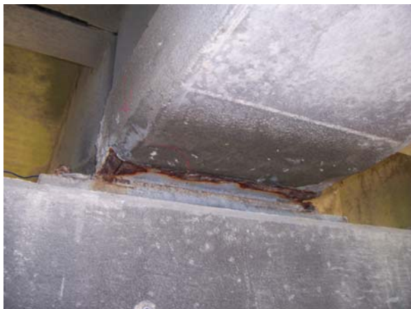
Span 54; West elevation