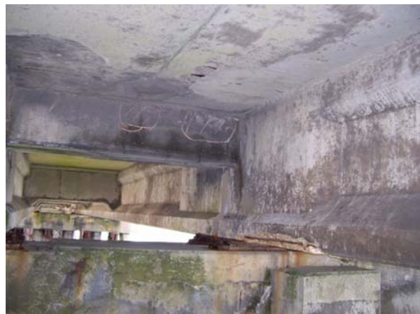
Span 116; East elevation