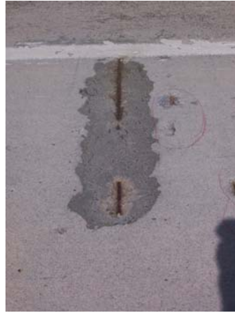
Span 102; deck surface