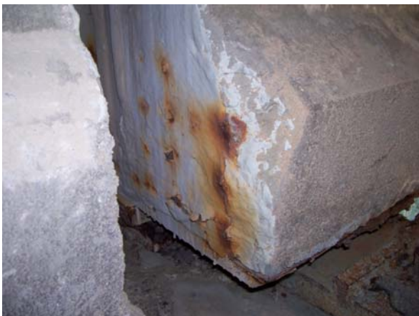
Span 48; Showing cracking at end of girder