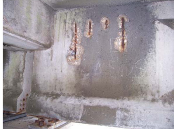
Span 65; West elevation