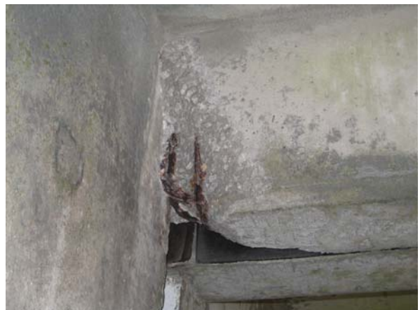
Span 176; deck soffit; south