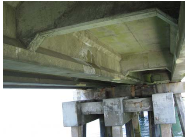
Span 175-176, Girder #3 core