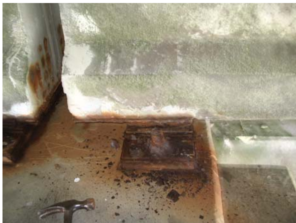
Span 176; West elevation