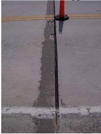
Span 102; deck surface