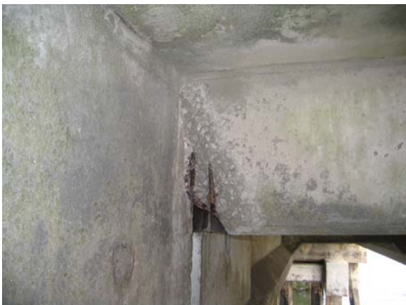
Span 176; deck soffit; south