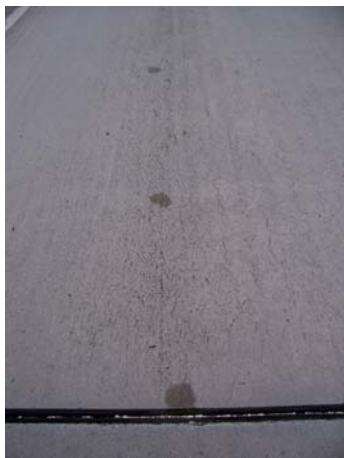
Span 35; deck surface