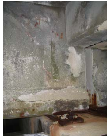
Span 176; East elevation