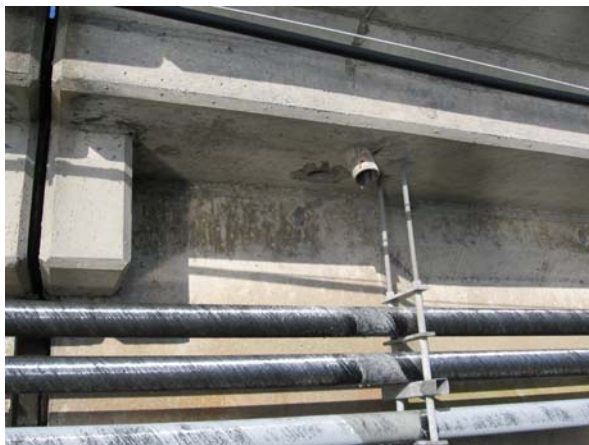
Span 93-94, South deck core