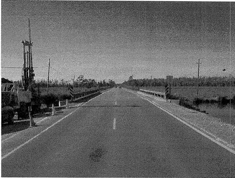
Looking west along -L-