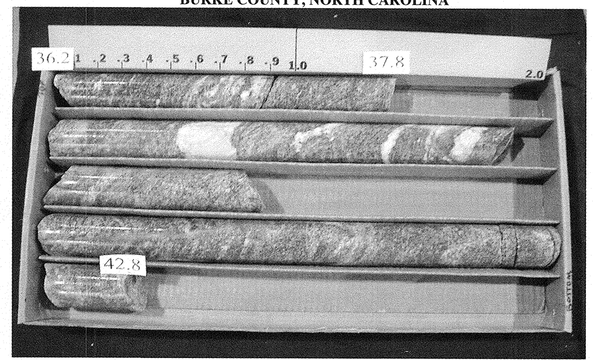
B1-A Box 1 of 2