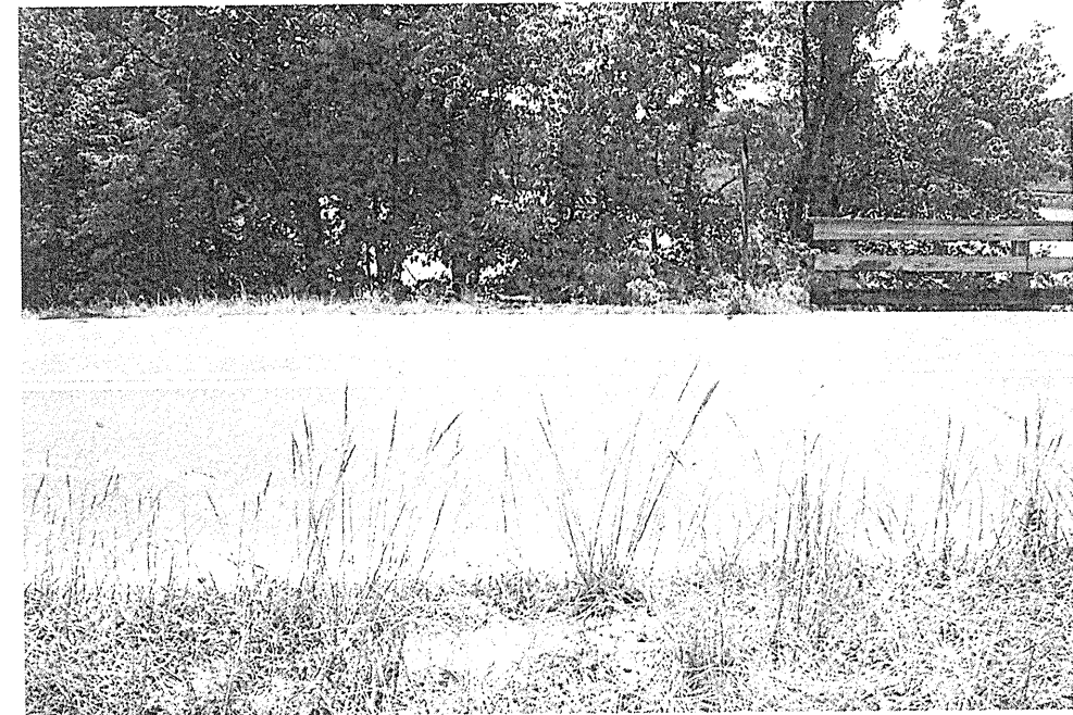
Photograph 9 – View Left to Right Across End Bent-2