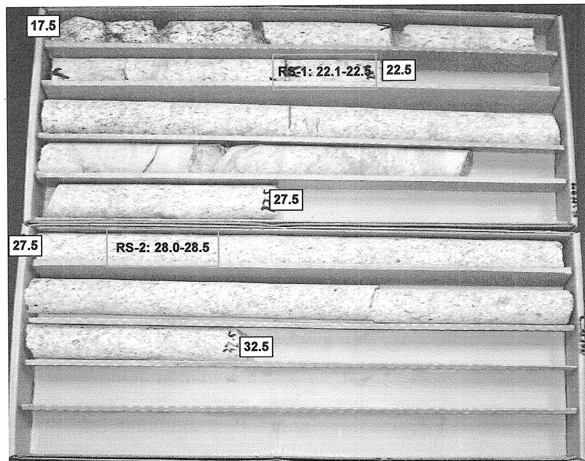
B1-A BOXES 1 & 2: 17.5 - 32.5 FEET