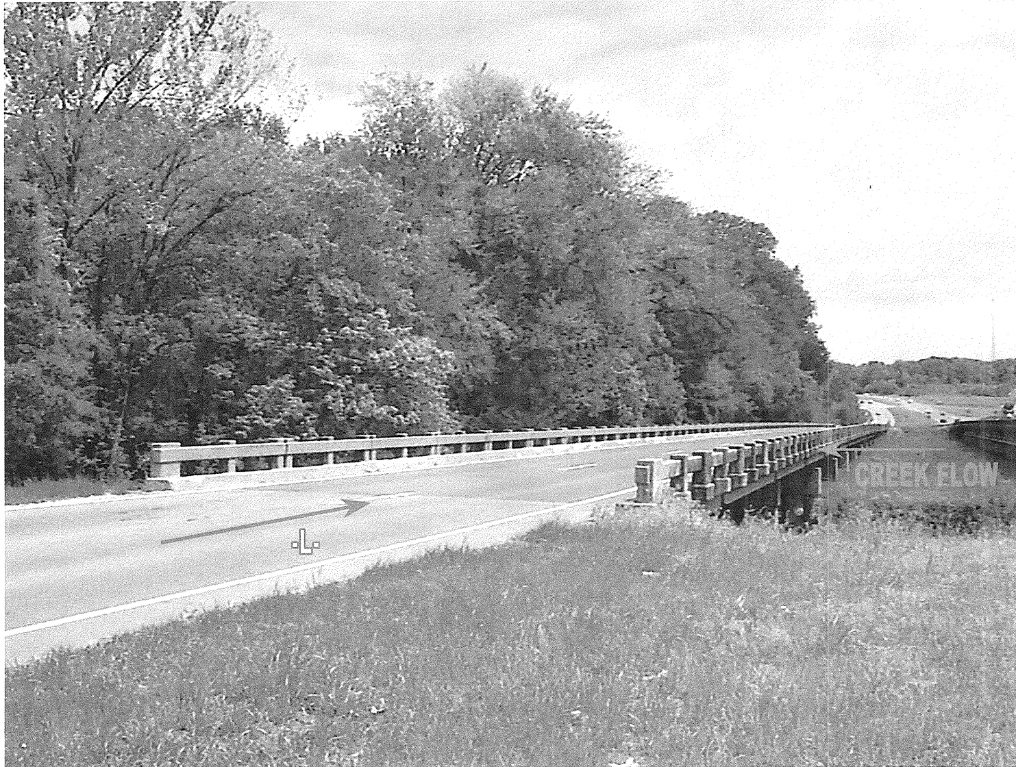
ANOTHER VIEW OF US 74 WBL BRIDGE LOOKING TOWARDS POLKTON