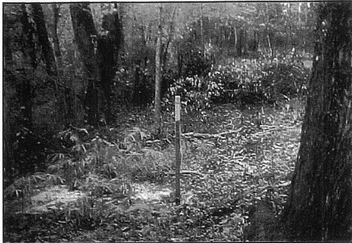
Photograph 9: View looking north along Left Lane Bent 8 from B8-B in foreground to B8-A.