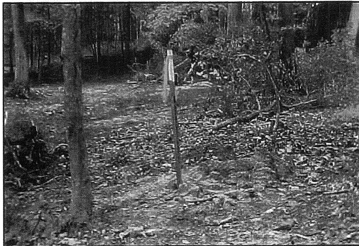
Photograph 10: View looking north along Left Lane End Bent 2 from EB2-B in foreground to EB2-A.