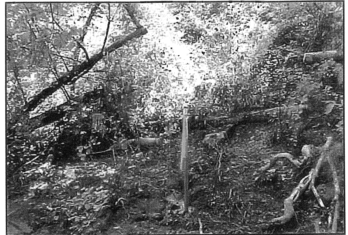
Photograph 11: View looking south along Right Lane End Bent 1 from EB1-A in foreground toward EB1-B.