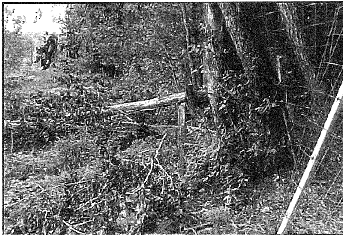
Photograph 18: View looking north along Left Lane Bent 7 from B7-B in foreground toward B7-A.