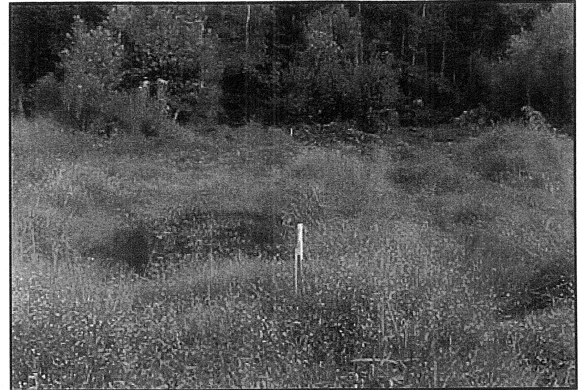
Photograph 30: View looking southeast along Right Lane Profile from B5-B RL in foreground toward B7-B RL

Clayton Bypass over Austin Pond LAW Job Number 30725-1-4791