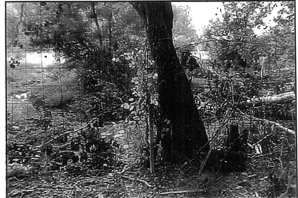
Photograph 31: View looking northwest along Right Lane Profile from B7-B RL in foreground toward B6-B RL.