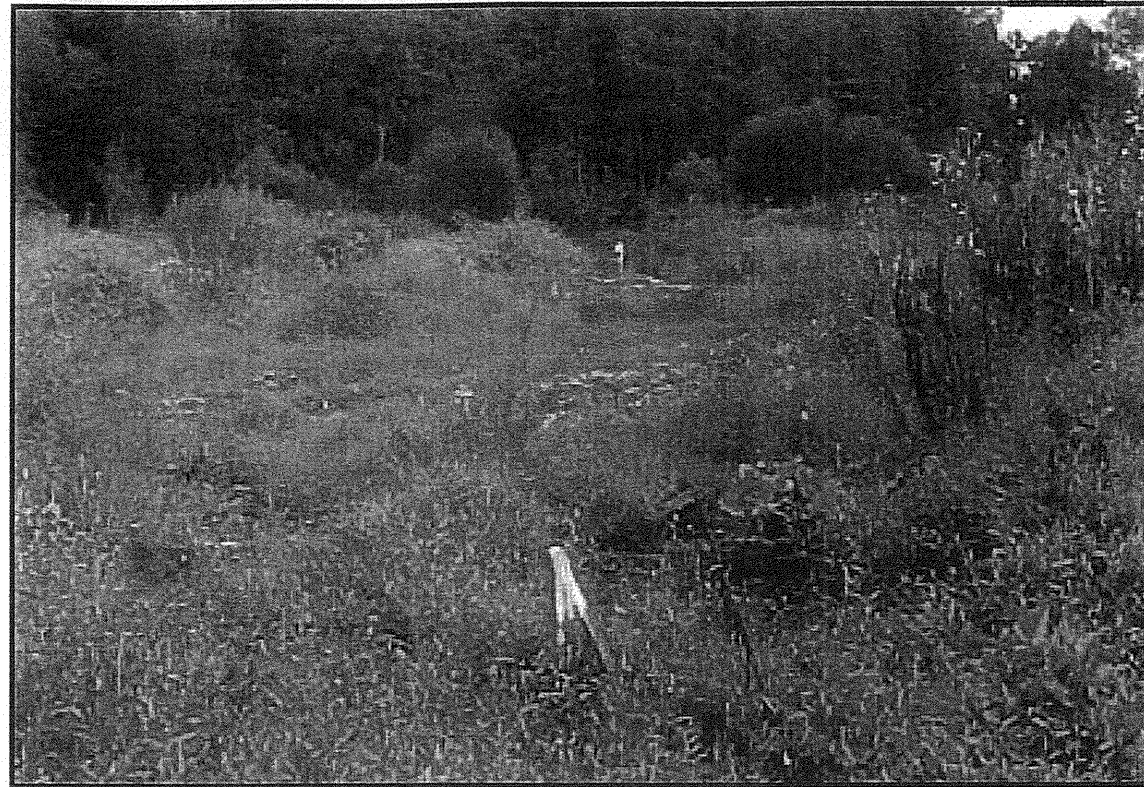
Photograph 28: View looking southeast along Right Lane Profile from B2-B in foreground toward B4-B.

Clayton Bypass over Austin Pond LAW Job Number 30725-1-4791