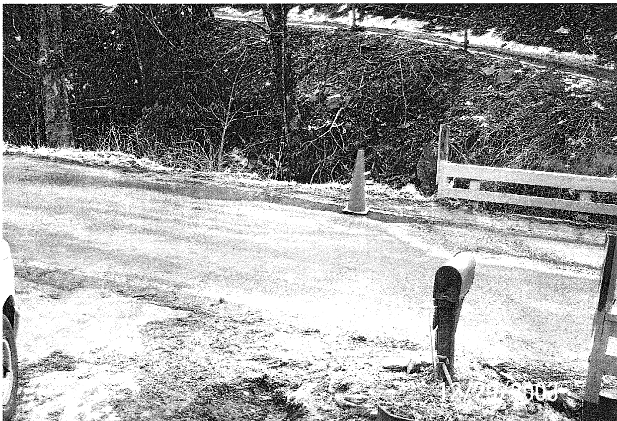
Photograph 2: View of End Bent-2 from Left to Right