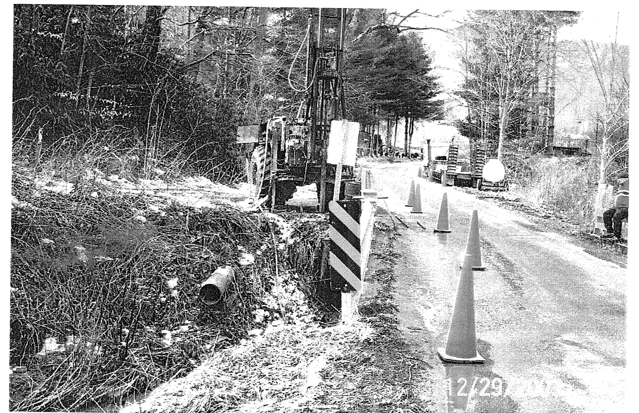
Photograph 4: View Approximately 13 ft. Right of -L- Looking Downstation