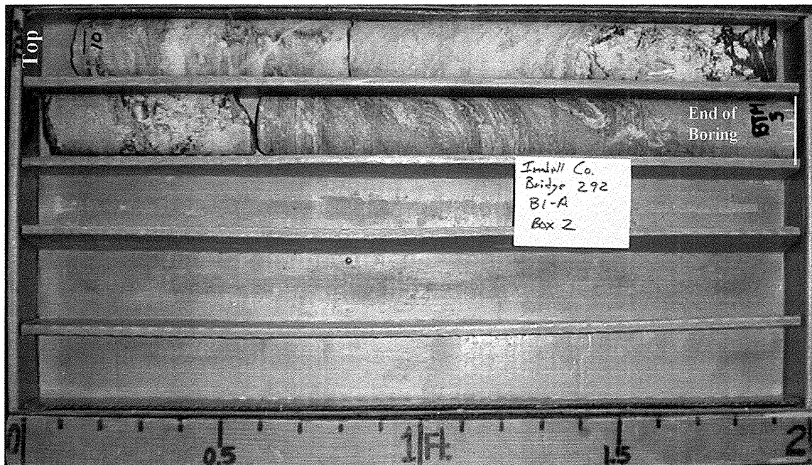
Bent 1, Hole A, Box 2/2