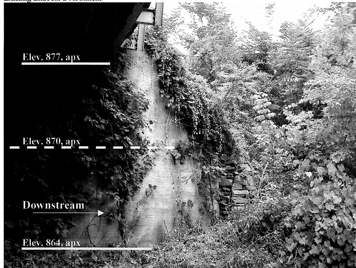
Existing Endbent 2 Abutment