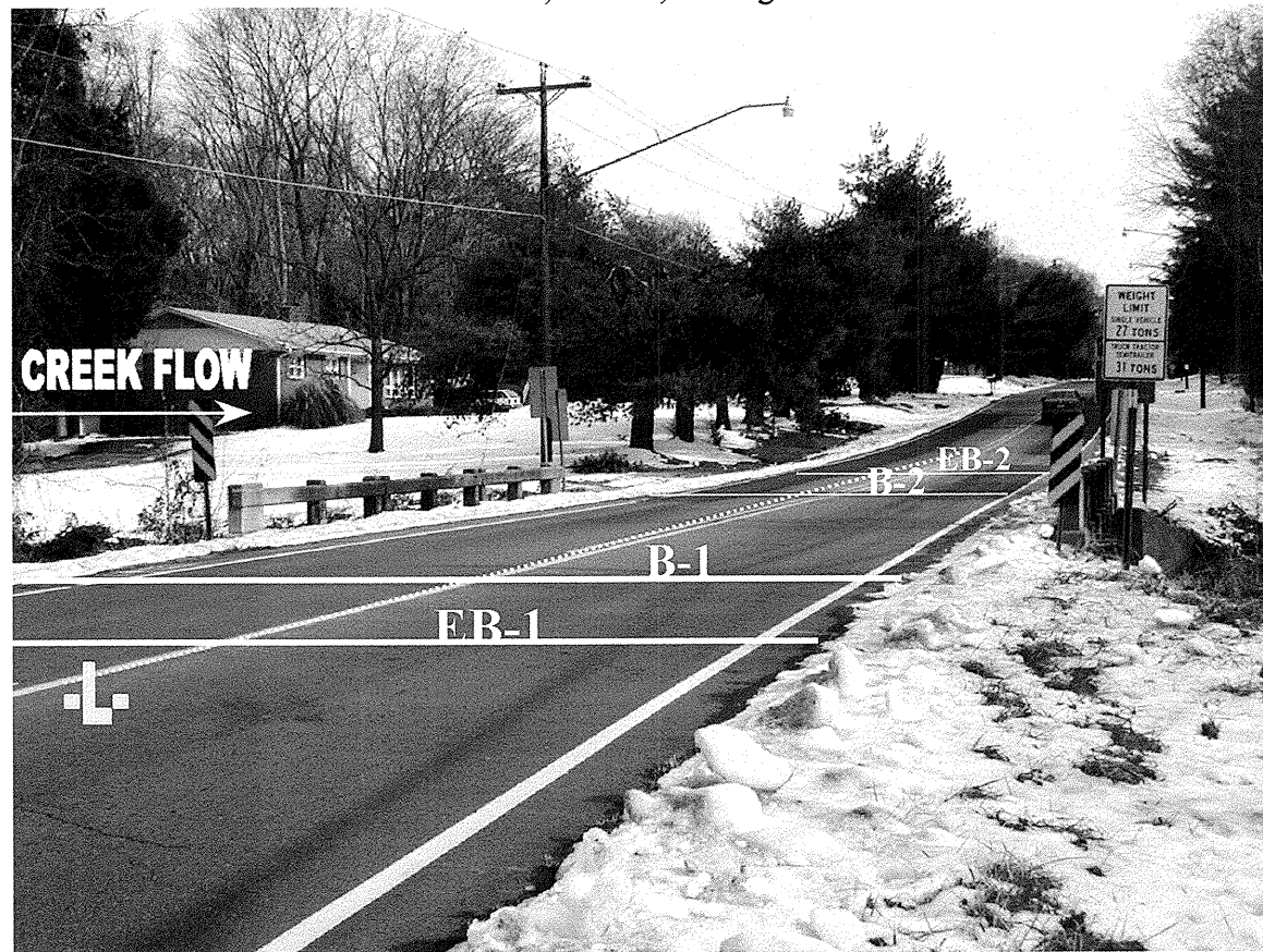
-L- Line, SR 1525, Looking East