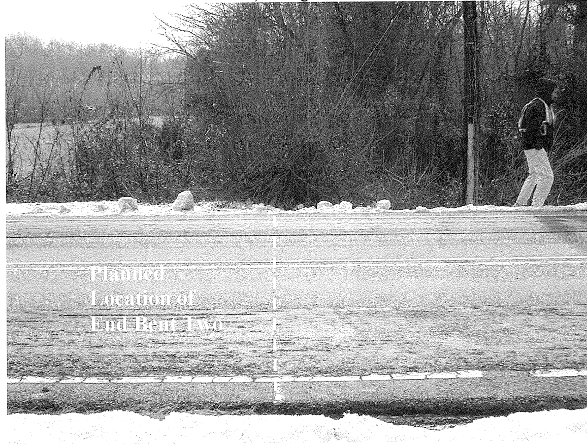
End Bent Two, Looking toward Detour Line