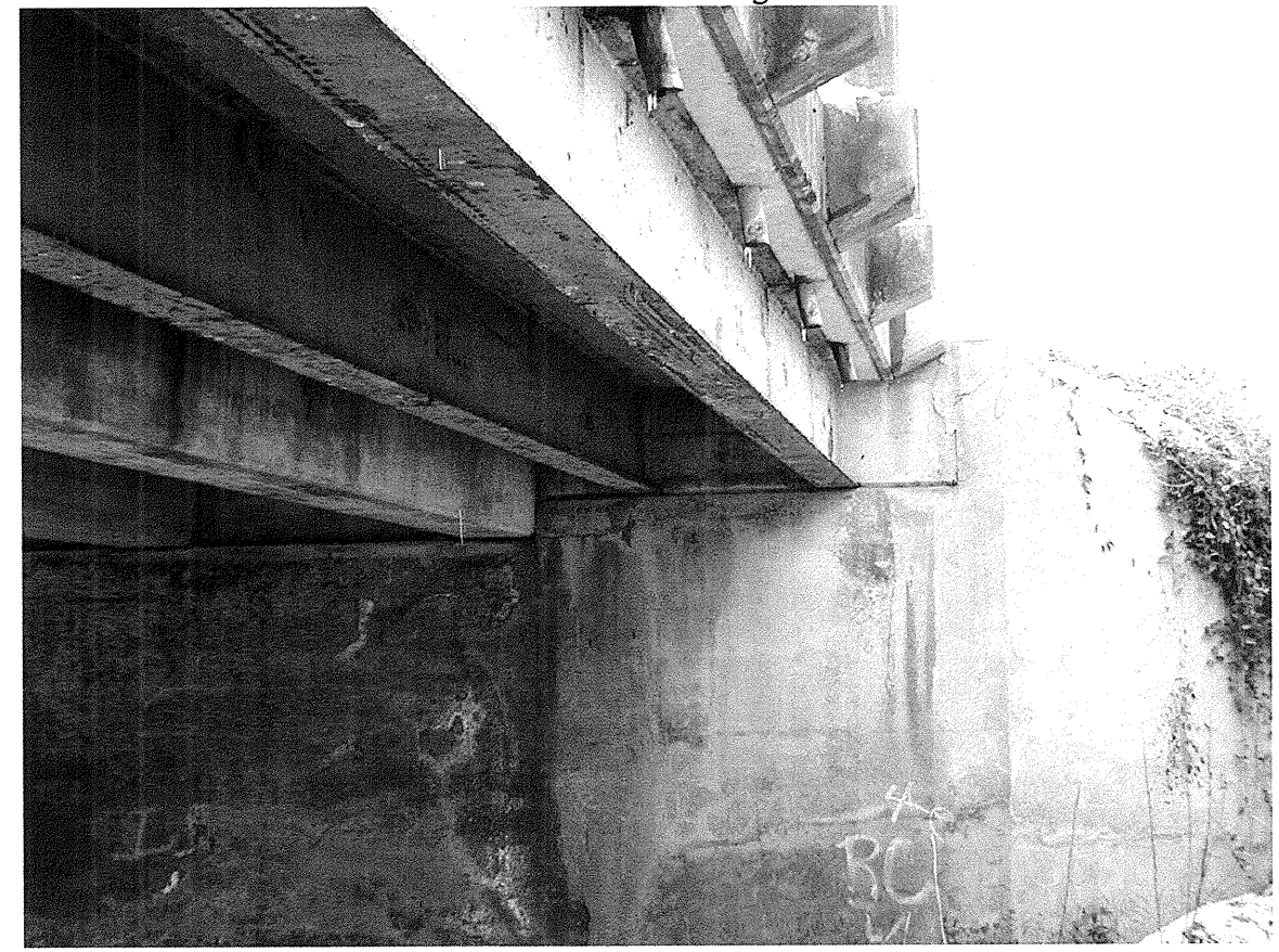
View Under the Bridge