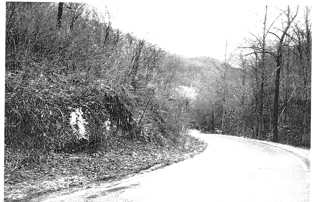
Photograph 8: View of Rock Outcrop at Proposed Retaining Wall Location Looking Upstation