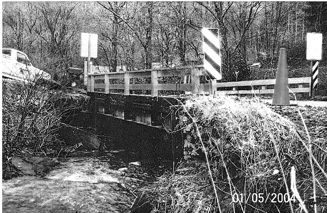
Photograph 5: View from Upstream Side of Bridge Looking Downstream