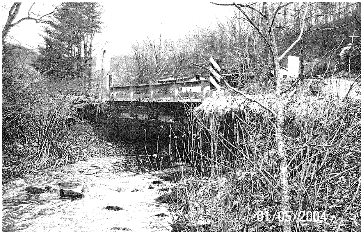
Photograph 6: View from Downstream Side of Bridge Looking Upstream