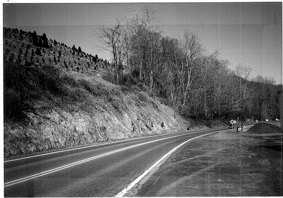
View on NC 88 looking up station from a point near the beginning of the project

PROJECT NO. 8.1711301 (B-3300) ASHE COUNTY