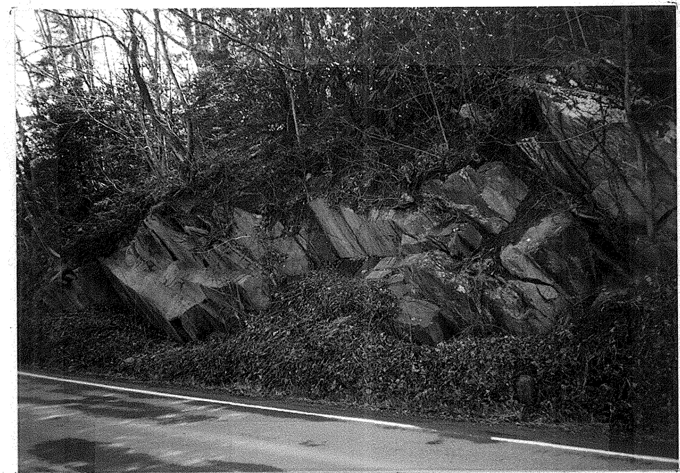
Rock outcrops on SR 1131, Station 15+75, 100' Left