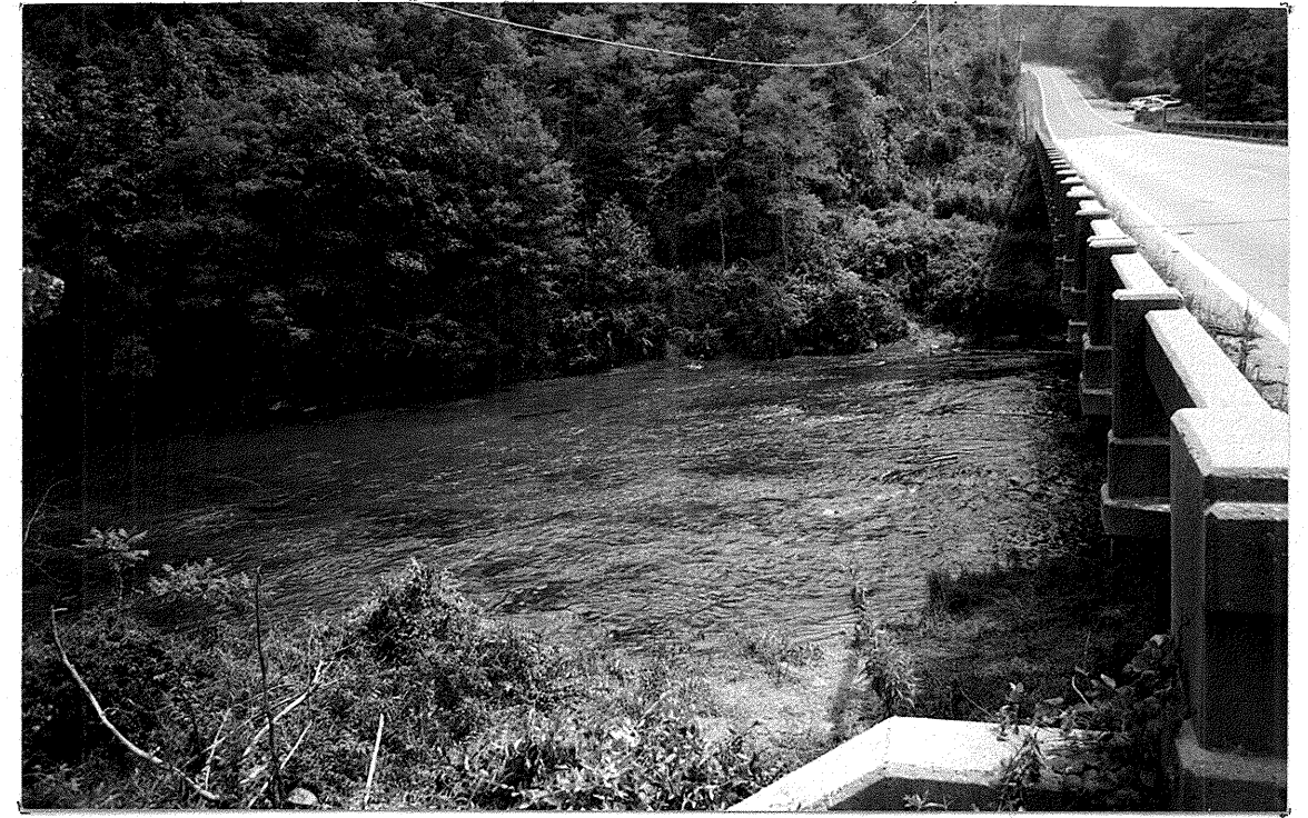
Fig. 3 View back station from a point near EB2-A

PROJECT NO: 8.1711401 (B-4010) COUNTY: Ashe