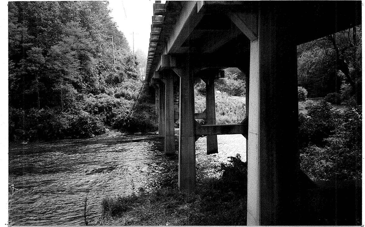
Fig.4 View back station from a point near B2.