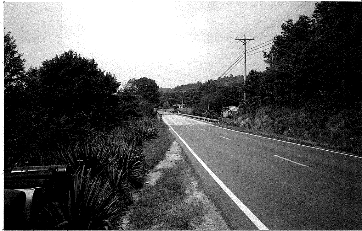
Fig. 1 Bridge No. 7 on NC 163. View up station.

PROJECT NO: 8.1711401 (B-4010) COUNTY: Ashe