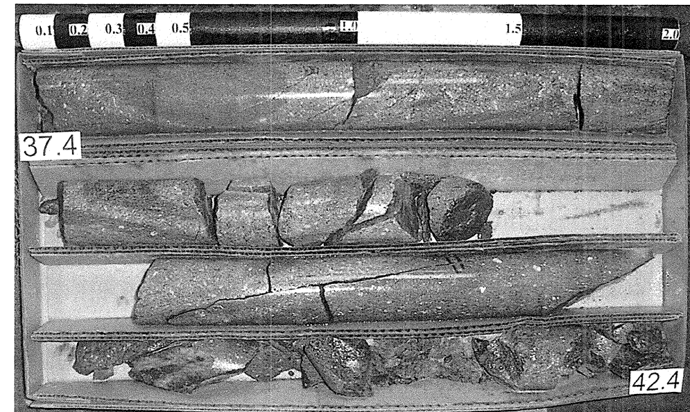
Box 6 of 6