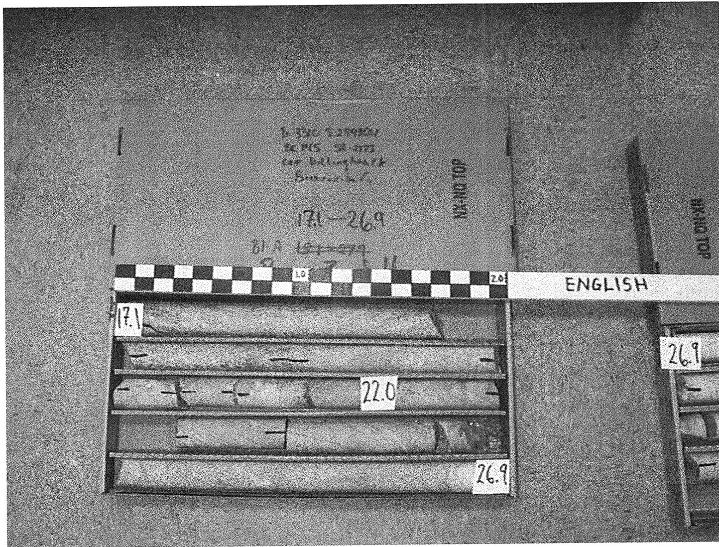
8.2843601 B-3310 Buncombe County Bridge NO.145 on SR-2173 over Dillingham Creek. B1-A 3 of 4