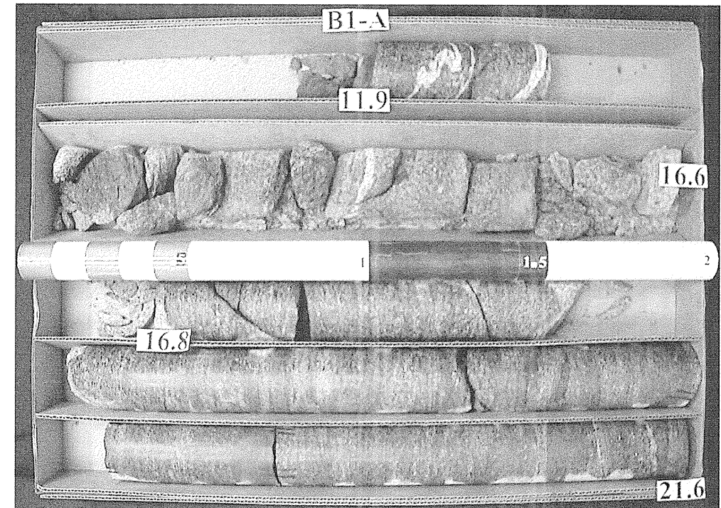
Box 3 and 4 of 7