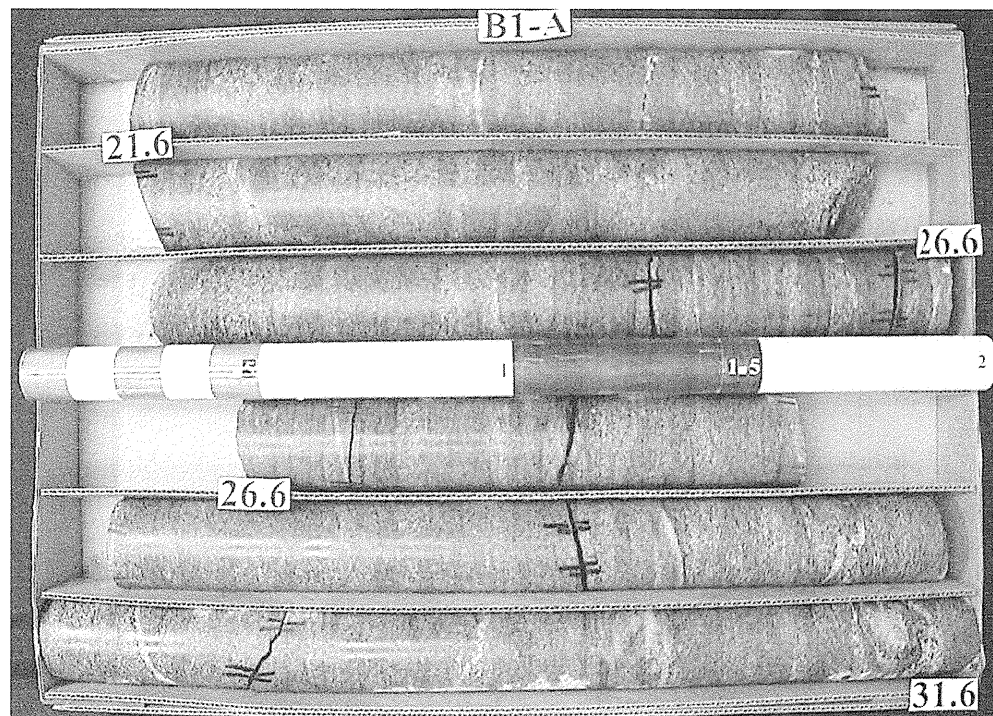
Box 5 and 6 of 7