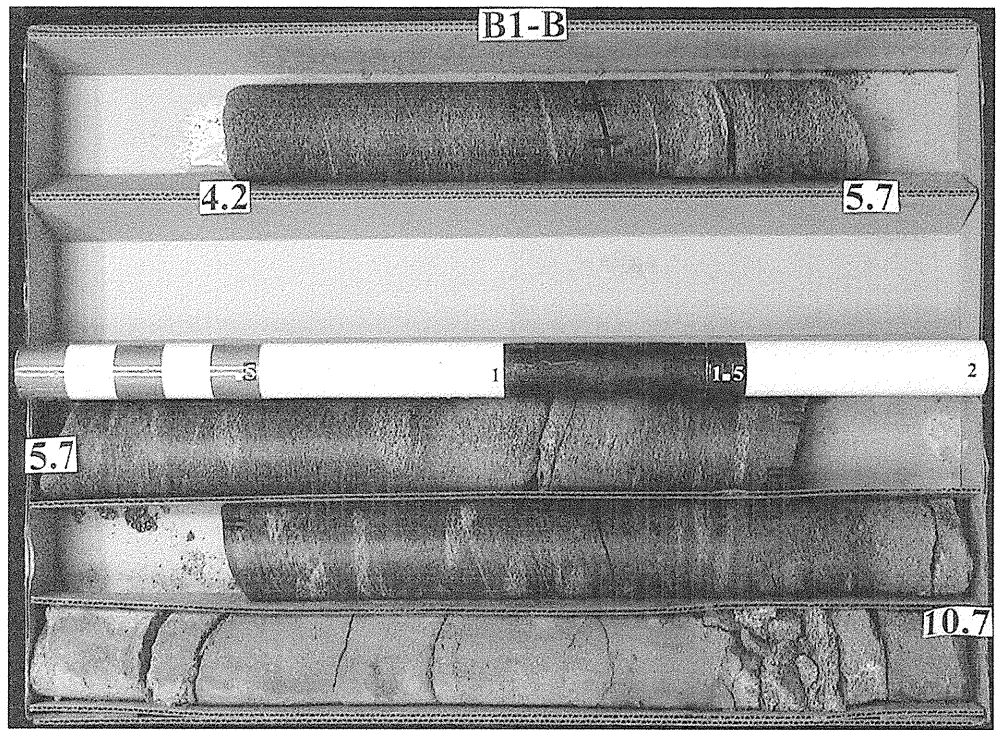
Box 1 and 2 of 6