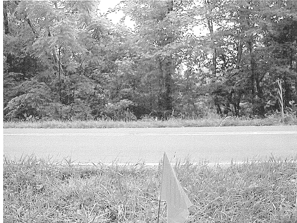
Photograph 1: View of Proposed End Bent 1 From Right to Left