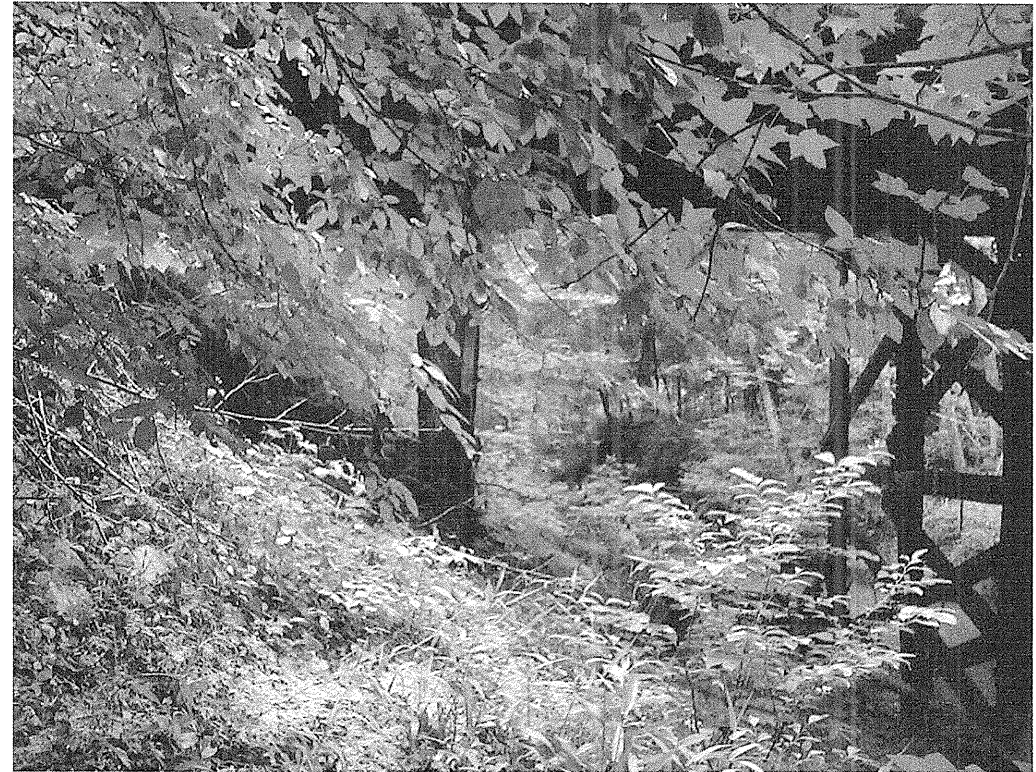
Photograph 3: View of Proposed Bent 2 From Left to Right